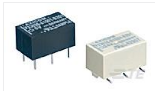
TE Part #1422015-9 V23026D1025B201 *X020