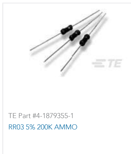
TE Part #4-1879355-1 RR03 5% 200K AMMO