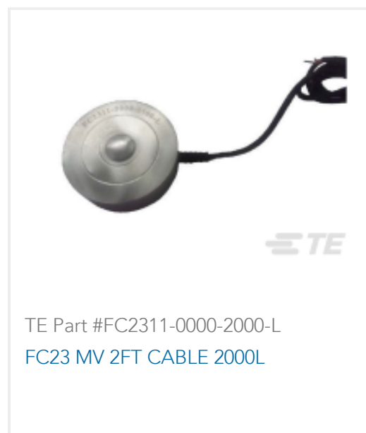
TE Part #FC2311-0000-2000-L FC23 MV 2FT CABLE 2000L