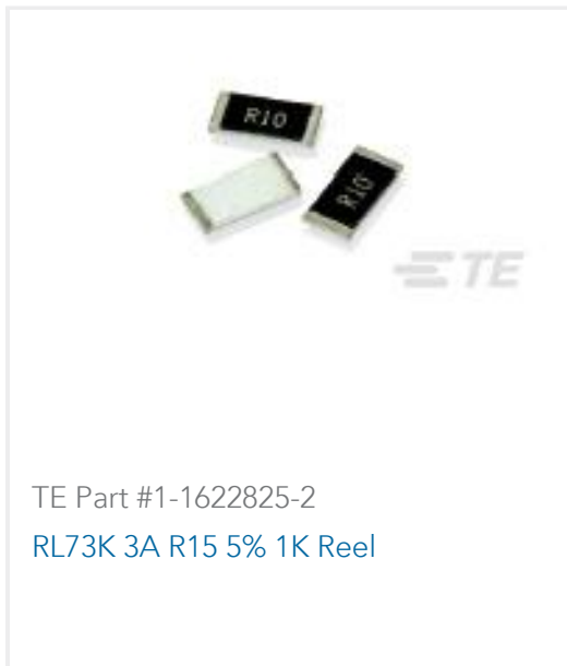
TE Part #1-1622825-2 RL73K 3A R15 5% 1K Reel