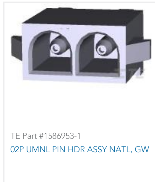
TE Part #1586953-1 02P UMNL PIN HDR ASSY NATL, GW