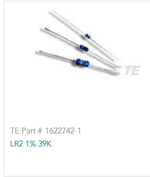
TE Part # 1622742-1 LR2 1% 39K