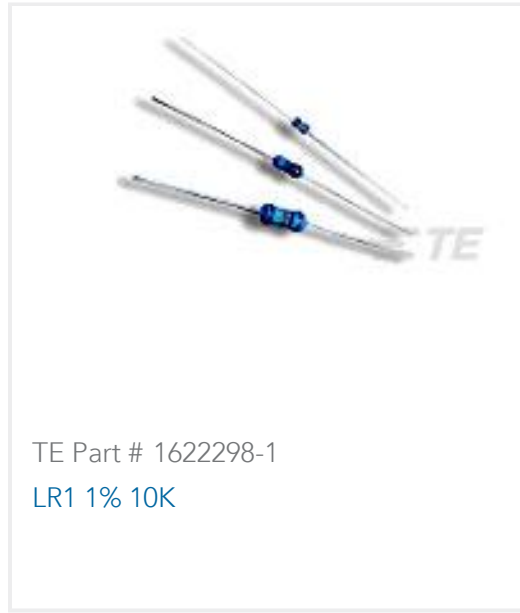
TE Part # 1622298-1 LR1 1% 10K