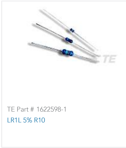
TE Part # 1622598-1 LR1L 5% R10