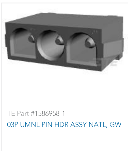
TE Part #1586958-1 03P UMNL PIN HDR ASSY NATL, GW