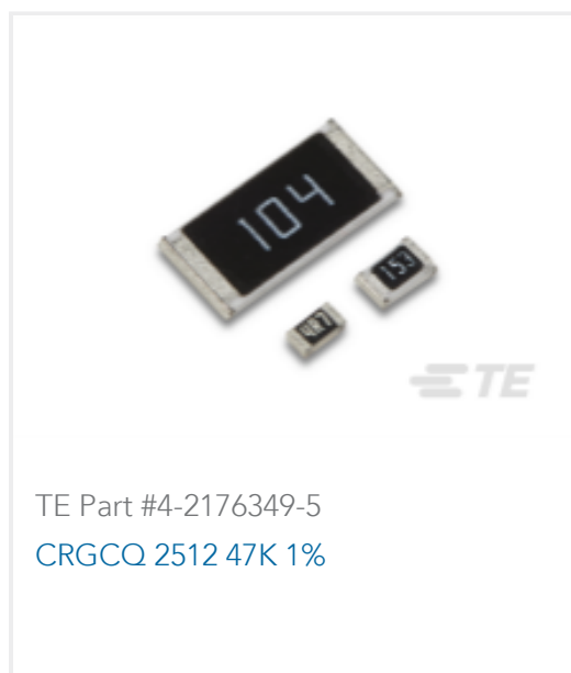
TE Part #4-2176349-5 CRGCQ 2512 47K 1%