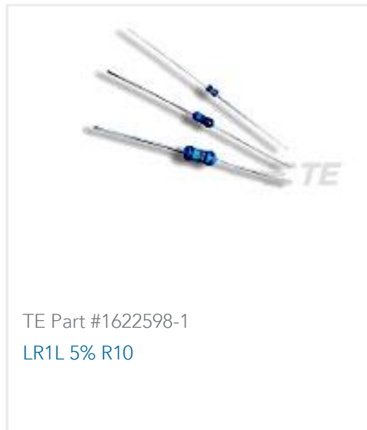
TE Part #1622598-1 LR1L 5% R10