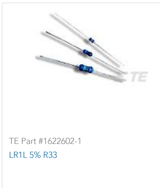
TE Part #1622602-1 LR1L 5% R33