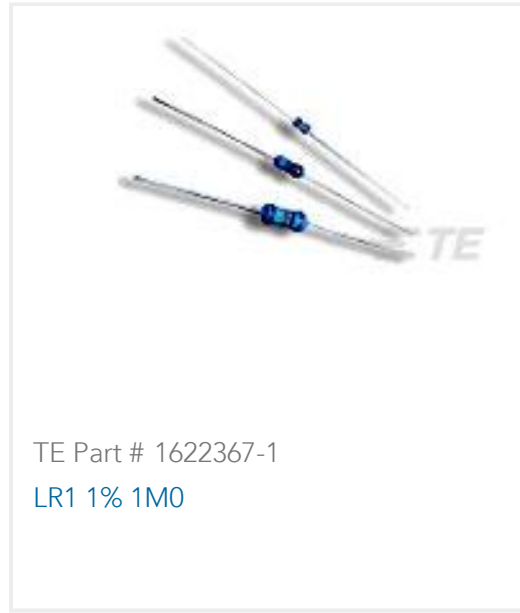
TE Part # 1622367-1 LR1 1% 1M0