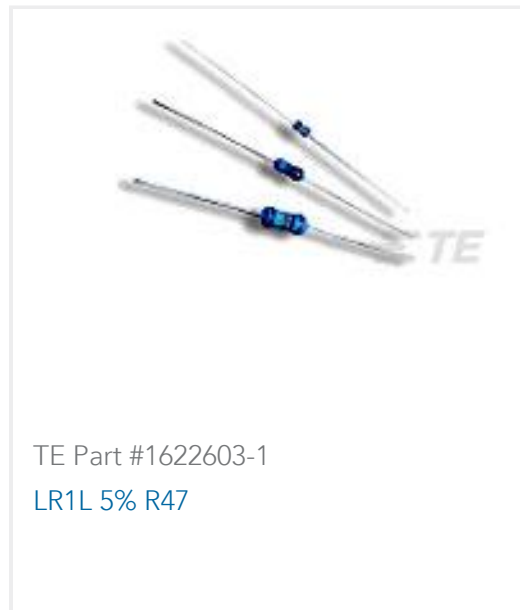
TE Part #1622603-1 LR1L 5% R47