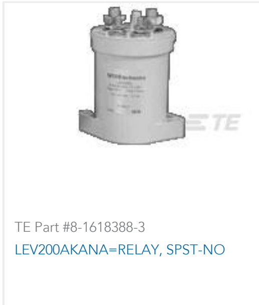
TE Part #8-1618388-3 LEV200AKANA=RELAY, SPST-NO