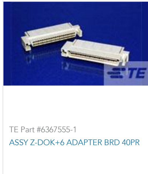
TE Part #6367555-1 ASSY Z-DOK+6 ADAPTER BRD 40PR