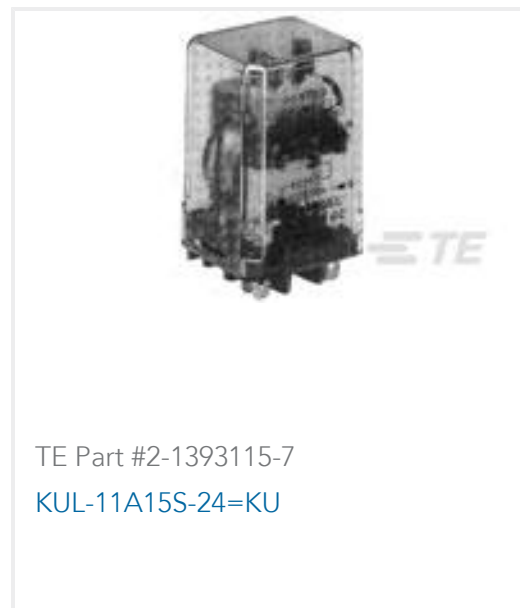
TE Part #2-1393115-7 KUL-11A15S-24=KU