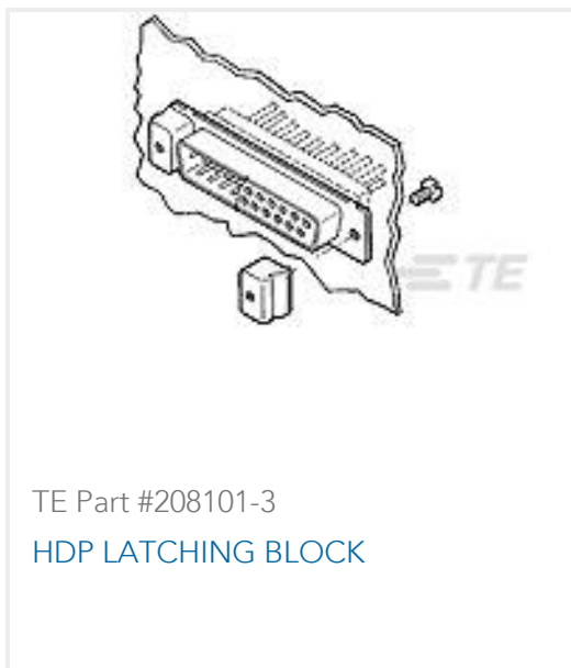
TE Part #208101-3 HDP LATCHING BLOCK