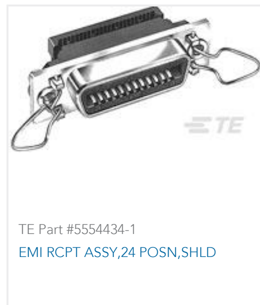
TE Part #5554434-1 EMI RCPT ASSY,24 POSN,SHLD