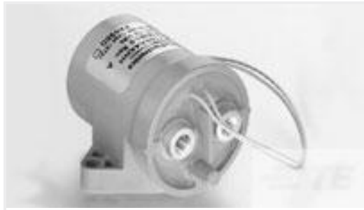
TE Part # 4-1618391-2 LEV100A6ANH=RELAY,SPST-NO, 48VDC VMT 15