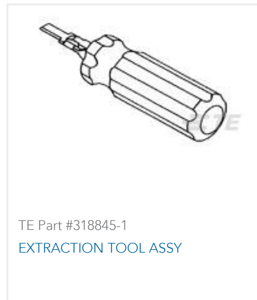
TE Part #318845-1 EXTRACTION TOOL ASSY