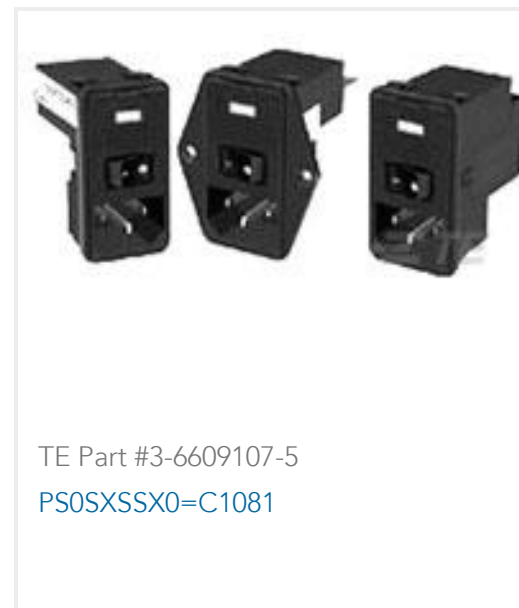
TE Part #3-6609107-5 PS0SXSSX0=C1081