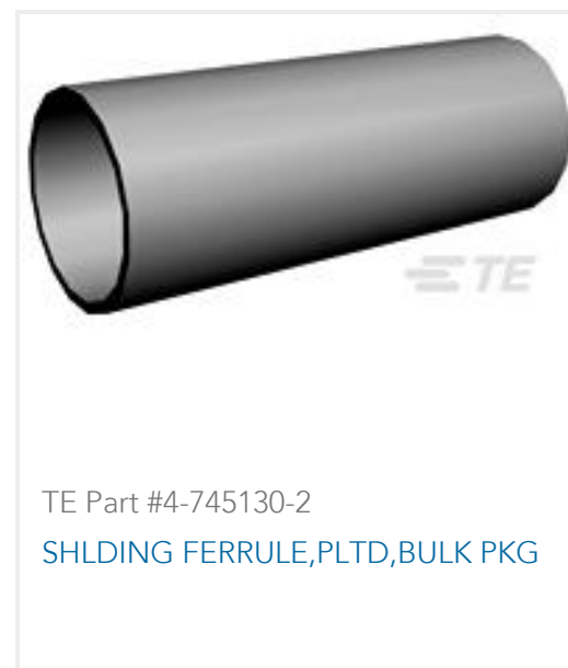
TE Part #4-745130-2 SHLDING FERRULE,PLTD,BULK PKG