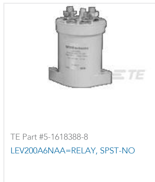
TE Part #5-1618388-8 LEV200A6NAA=RELAY, SPST-NO