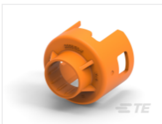
TE Part #2355153-1 COVER,IPT 3P