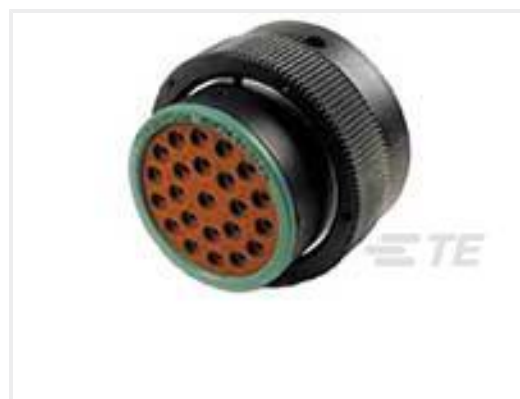
TE Part #HDP26-24-23PN PLG, 23P, BLK, N, 16, P