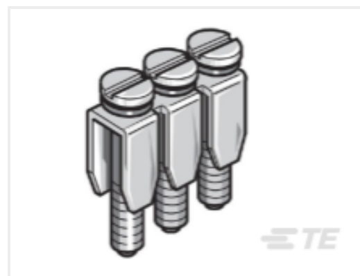
TE Part #1SNA173615R2500 BJM10