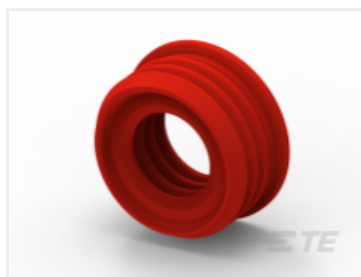
TE Part #2355151-2 SWS,COAX