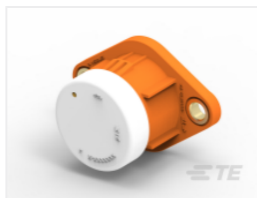
TE Part #2371019-1 1POS,IPT,RING TONGUE HSG ASSY, SLD