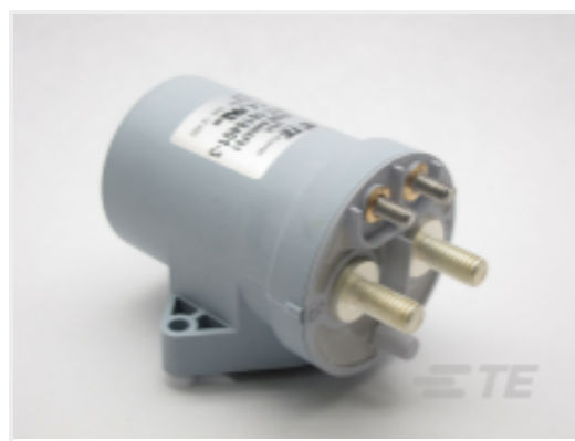
TE Part #5-1618388-7 LEV200A6ANF=RELAY, SPST-NO