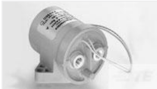
TE Part # 4-1618391-0 LEV100A4ANH=RELAY,SPST-NO, 12VDC