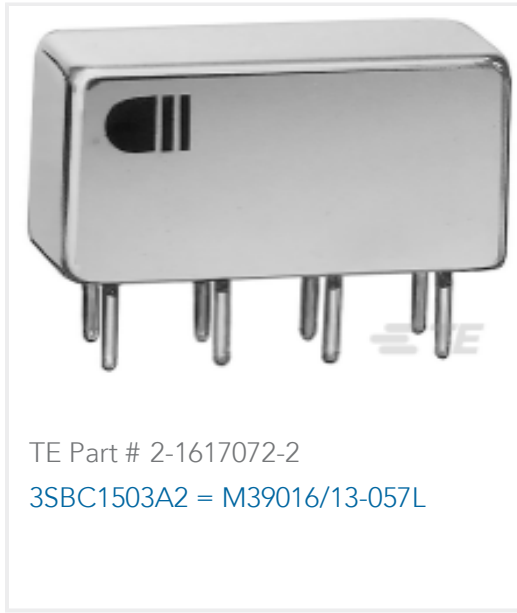
TE Part # 2-1617072-2 3SBC1503A2 = M39016/13-057L