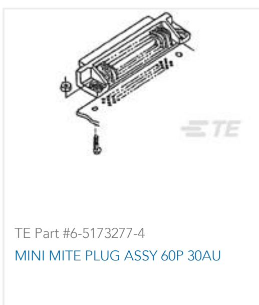
TE Part #6-5173277-4 MINI MITE PLUG ASSY 60P 30AU