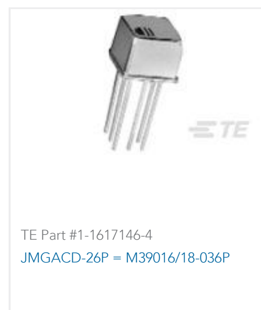
TE Part #1-1617146-4 JMGACD-26P = M39016/18-036P