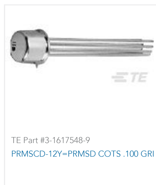
TE Part #3-1617548-9 PRMSCD-12Y=PRMSD COTS .100 GRI