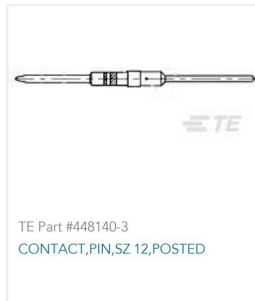
TE Part #448140-3 CONTACT,PIN,SZ 12,POSTED