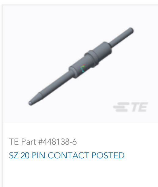
TE Part #448138-6 SZ 20 PIN CONTACT POSTED