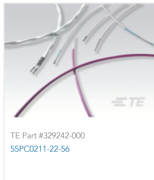
TE Part #329242-000 55PC0211-22-56