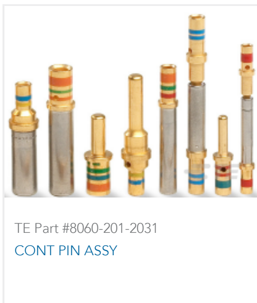
TE Part #8060-201-2031 CONT PIN ASSY