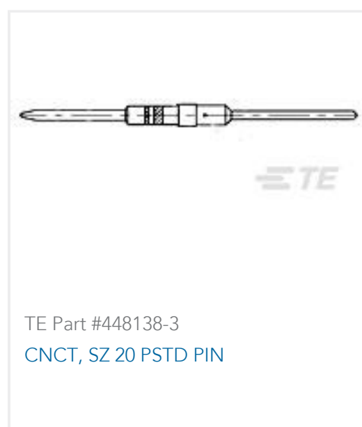
TE Part #448138-3 CNCT, SZ 20 PSTD PIN