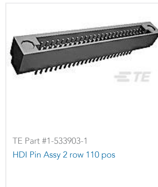
TE Part #1-533903-1 HDI Pin Assy 2 row 110 pos