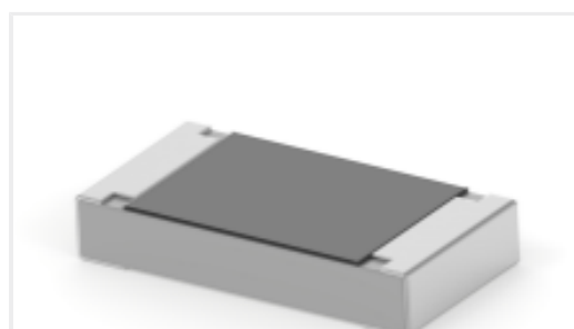
TE Part #2176344-8 CRGCQ 1206 15R 5%