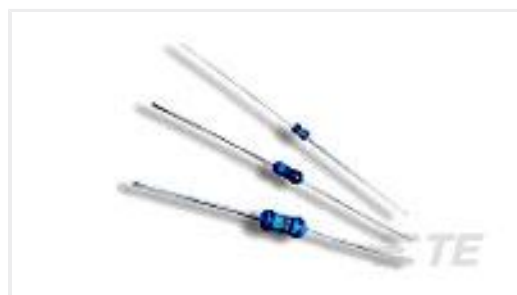
TE Part #1622765-1 LR2 1% 56R