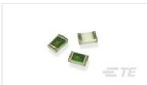
TE Part #3-1879127-1 RN 0402 316R 0.1% 10PPM CUT LENGTH