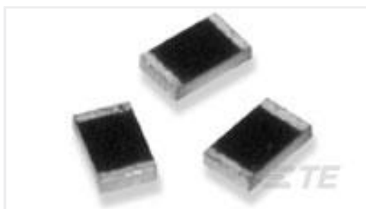
TE Part #5-1879743-6 RP 1J 17R8 0.1% 15PPM CUT LENGTH