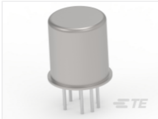
TE Part # 4-1617548-3 PRMSPD-26X=PRMSD COTS SENSITIV