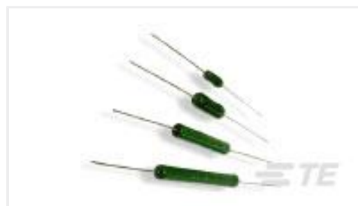
TE Part #2-1623772-3 C7 220R 5% AMMO PK