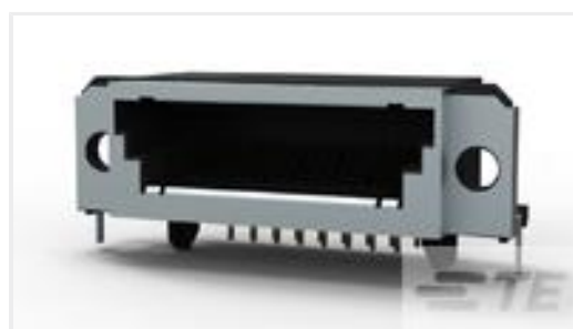
TE Part #5-1761185-6 16 SDL SE GRND RCPT ASSY