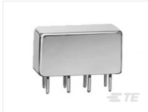
TE Part # 2-1617031-3 HFW1201K46 = M39016/6-209L