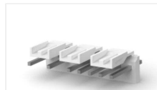
TE Part #3-1744319-9 09P MTA156 POL HDR ASSY LF OMIT 6&8