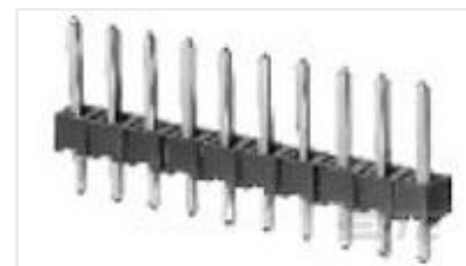
TE Part #5-146282-8 08 MODII HDR SRST B/A .100CL