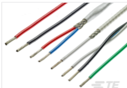
TE Part #CZ2802-000 44AM1111-24-6-9CS2275B