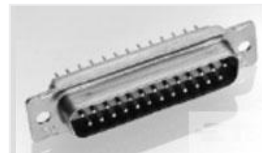
TE Part #205433-2 AMPLIMITE,ASY,RCPT,FB,109,2,CONT