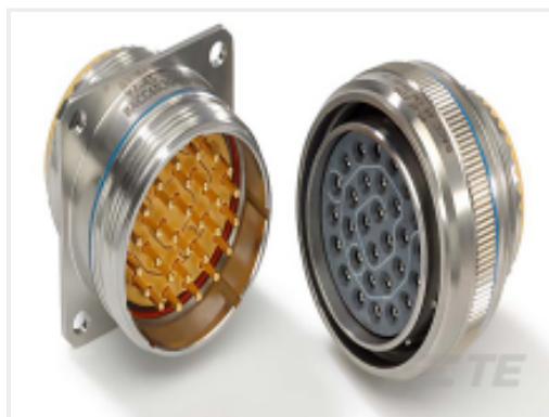
TE Part #ZPF000000000008619 983-6S 16-10 PN