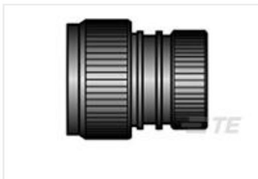
TE Part #434377-000 HEX40-AB-00-13-A3-2