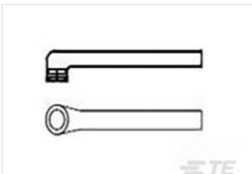
TE Part #806891-000 222D263-25-22-0