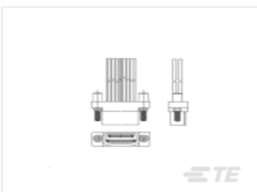
TE Part #5-1589474-5 STM037PC2DM024N = WDUALOBE