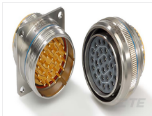
TE Part #ZPF000000000008642 983-6S 18-14 PN