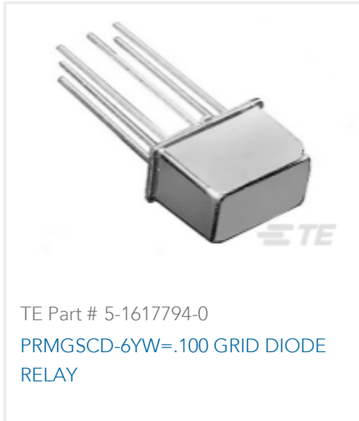
TE Part # 5-1617794-0 PRMGSCD-6YW=.100 GRID DIODE RELAY