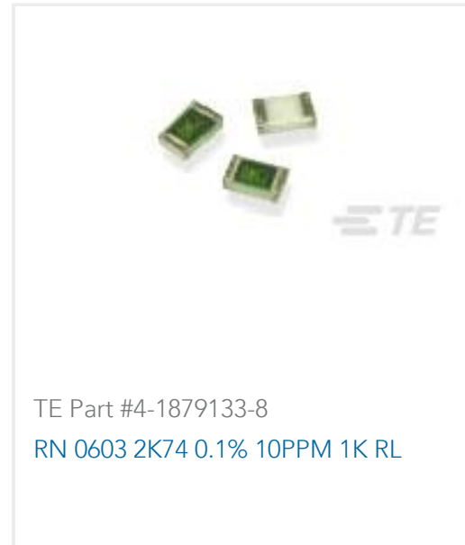
TE Part #4-1879133-8 RN 0603 2K74 0.1% 10PPM 1K RL