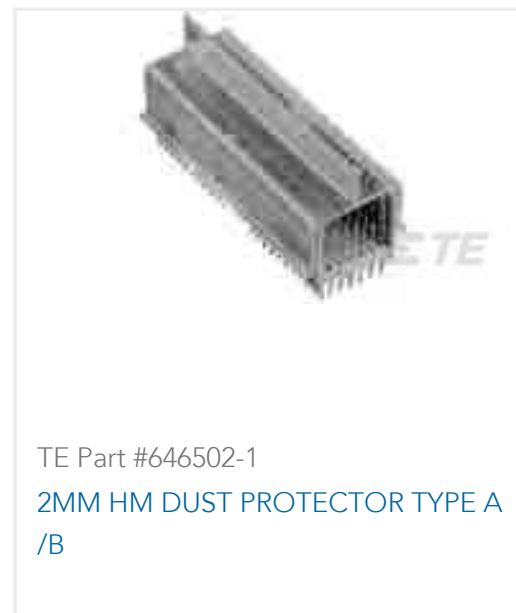
TE Part #646502-1 2MM HM DUST PROTECTOR TYPE A /B