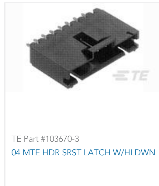
TE Part #103670-3 04 MTE HDR SRST LATCH W/HLDWN