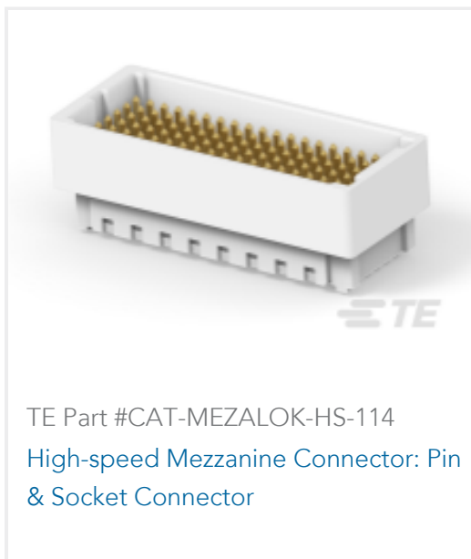
TE Part #CAT-MEZALOK-HS-114 High-speed Mezzanine Connector: Pin & Socket Connector