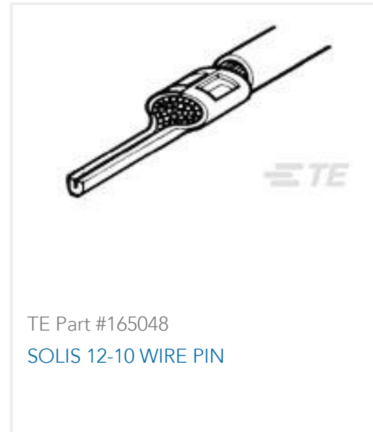
TE Part #165048 SOLIS 12-10 WIRE PIN