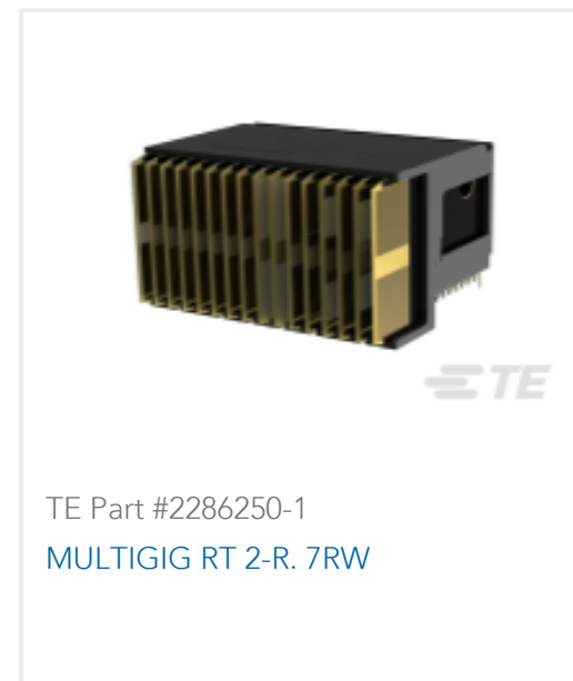
TE Part #2286250-1 MULTIGIG RT 2-R. 7RW