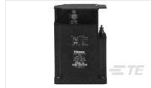
TE Part #4-1618002-5 EV500-4B=RELAY, PRESSURIZED, S