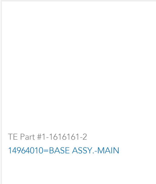
TE Part #1-1616161-2 14964010=BASE ASSY.-MAIN