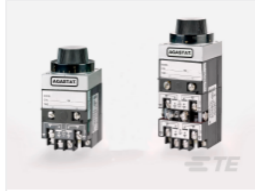
TE Part #1423158-7 7012L8ALLN=RLY,NAV,ON,2P,115VA