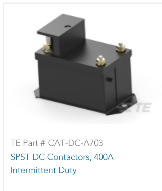
TE Part # CAT-DC-A703 SPST DC Contactors, 400A Intermittent Duty