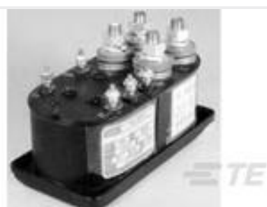
TE Part #1616084-2 AH965M=RELAY