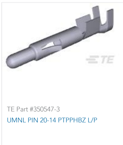
TE Part #350547-3 UMNL PIN 20-14 PTPPHBZ L/P