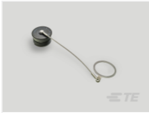
TE Part #YDTS32Z19RV0010000 CAP ASSEMBLY