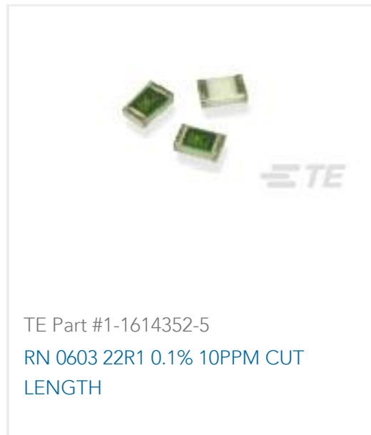
TE Part #1-1614352-5 RN 0603 22R1 0.1% 10PPM CUT LENGTH