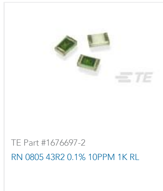
TE Part #1676697-2 RN 0805 43R2 0.1% 10PPM 1K RL