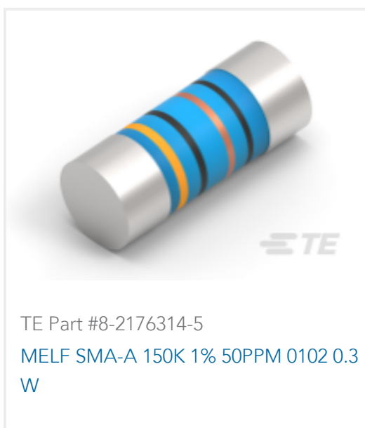
TE Part #8-2176314-5 MELF SMA-A 150K 1% 50PPM 0102 0.3 W