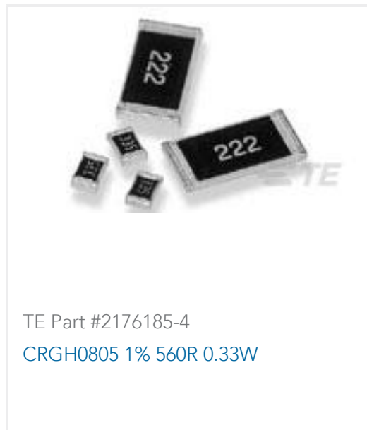
TE Part #2176185-4 CRGH0805 1% 560R 0.33W