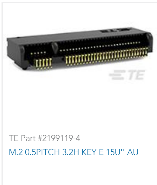
TE Part #2199119-4 M.2 0.5PITCH 3.2H KEY E 15U" AU