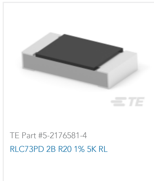
TE Part #5-2176581-4 RLC73PD 2B R20 1% 5K RL