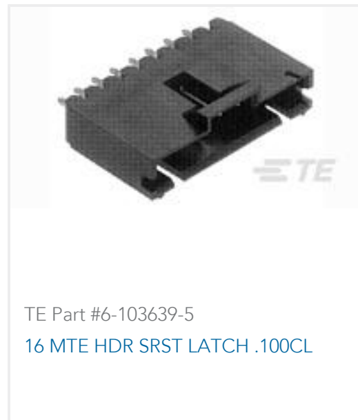
TE Part #6-103639-5 16 MTE HDR SRST LATCH .100CL