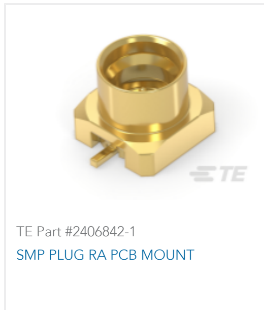
TE Part #2406842-1 SMP PLUG RA PCB MOUNT