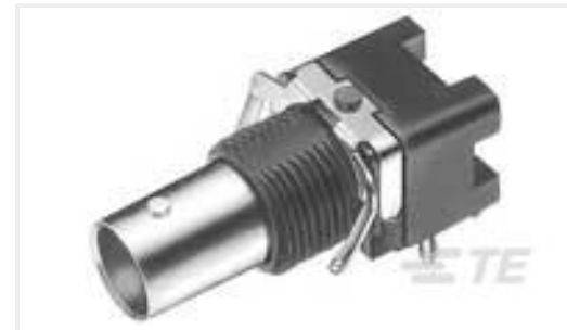
TE Part #5413524-5 JACK DECOUPLER PCB RTANG