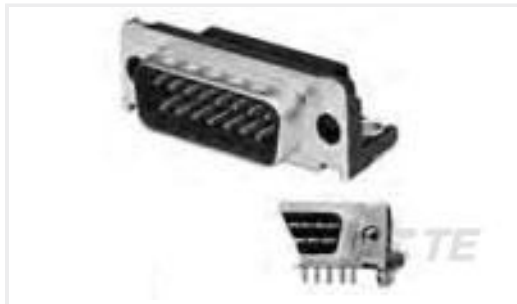
TE Part #5747252-4 37 MSFL PLUG RA 318 (IN,FM)