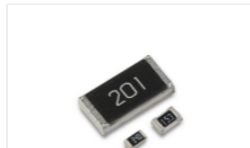
TE Part #3-2176328-2 CRGP 1206 3K9 1%