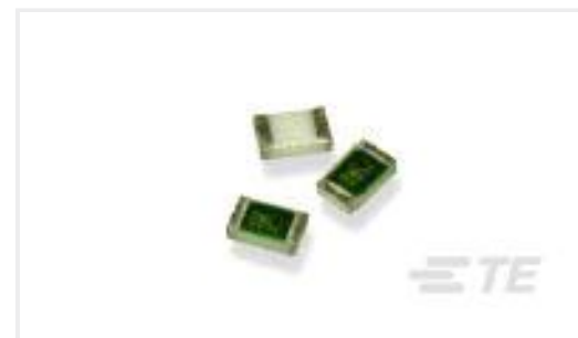
TE Part #2-1879061-7 CPF 0402 100R 0.1% 25PPM 5K RL