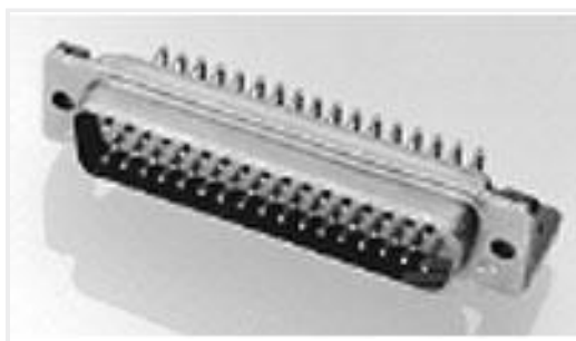
TE Part #1218440-5 AMPLIMITE,ASY,PLUG,RT ANG,109,5