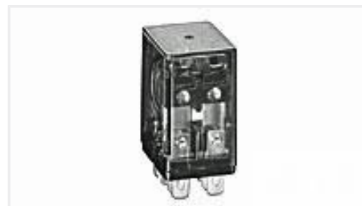
TE Part #6-1393144-5 K10P-11D55-110=K10/K20