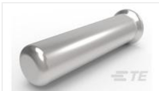
TE Part #5050462-7 SOCKET,MIN SPR SN SER-2