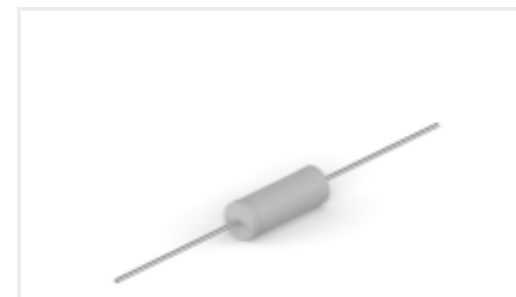
TE Part #2176412-8 5W XSM M/OX 5% 10R