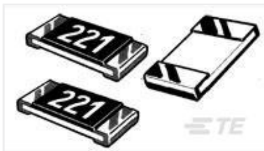
TE Part #2176230-1 3522 0R0 5% 3W