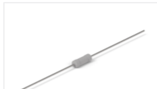
TE Part #3-1676123-5 1/2W SM M/OX 5% 22R