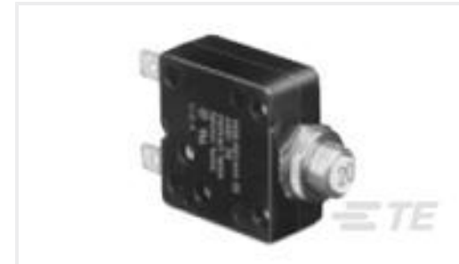
TE Part #2-1393249-2 W58-XB1A4A-8=W58