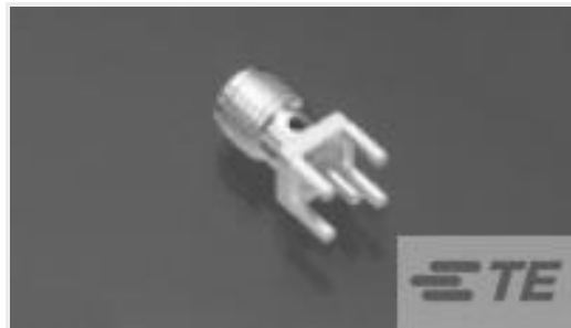
TE Part #6274096-1 JACK ASSEMBLY, ACTION PIN, SMA