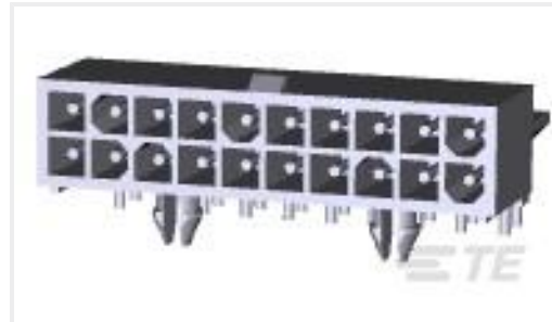
TE Part #1-794106-0 20P MINI UMNL R/A HDR ASSY