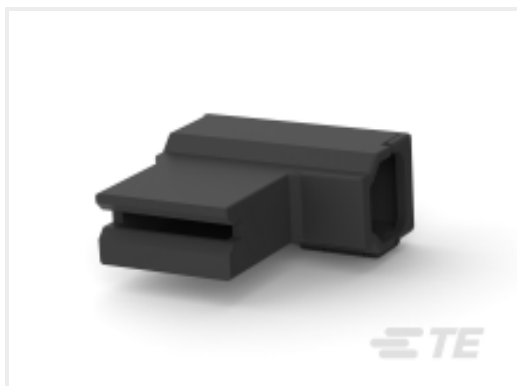
TE Part # 1969657-1 250 FASTON HSG., FLAG, REC., 1 POS, BLACK