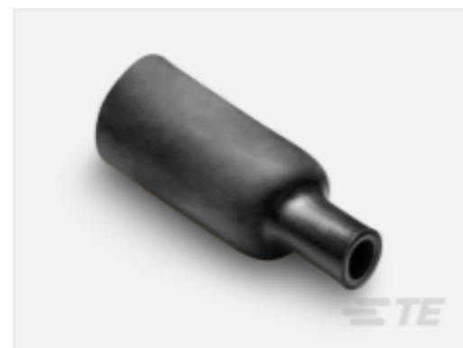
TE Part #ER34172001 DWHF-3/1-0-STK