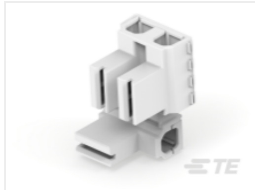
TE Part # 2238270-1 HSG, RECEPT, 250 FASTON FLAG, 3P, T9G