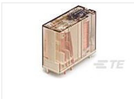
TE Part #1-1393258-7 V23047-A1024-A511