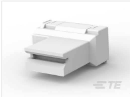
TE Part # 1969656-1 250 FASTON HSG., FLAG, REC., 1 POS, NATURAL