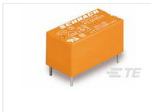
TE Part #1393219-3 PE014005