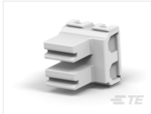
TE Part # 1969900-1 250 FASTON HSG., FLAG, REC., 2 POS, NATURAL