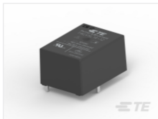
TE Part #1558666-1 T9GS1L14-5