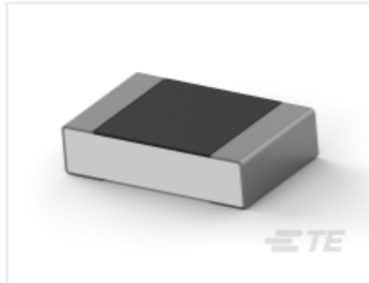
TE Part #4-2176374-5 RQ 0805 309R 0.1% 10PPM 1K RL