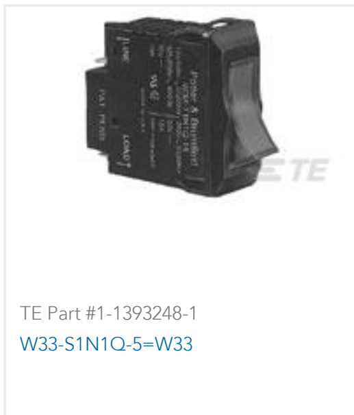
TE Part #1-1393248-1 W33-S1N1Q-5=W33