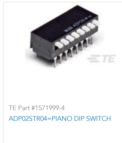
TE Part #1571999-4 ADP02STR04=PIANO DIP SWITCH