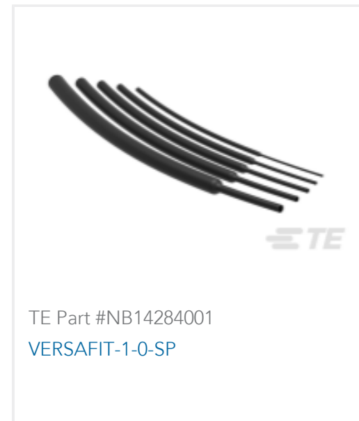
TE Part #NB14284001 VERSAFIT-1-0-SP