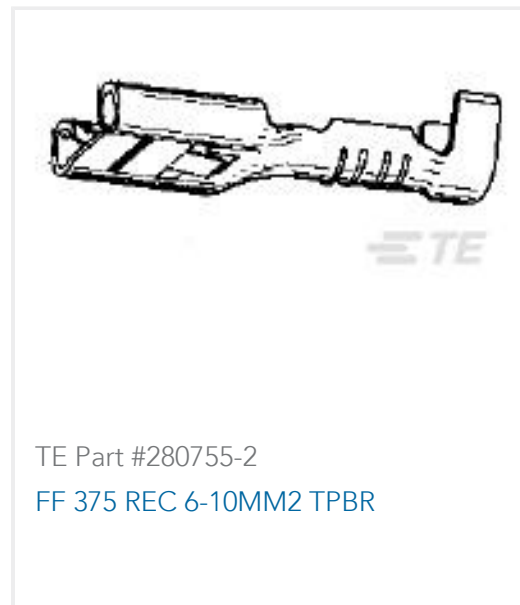
TE Part #280755-2 FF 375 REC 6-10MM2 TPBR