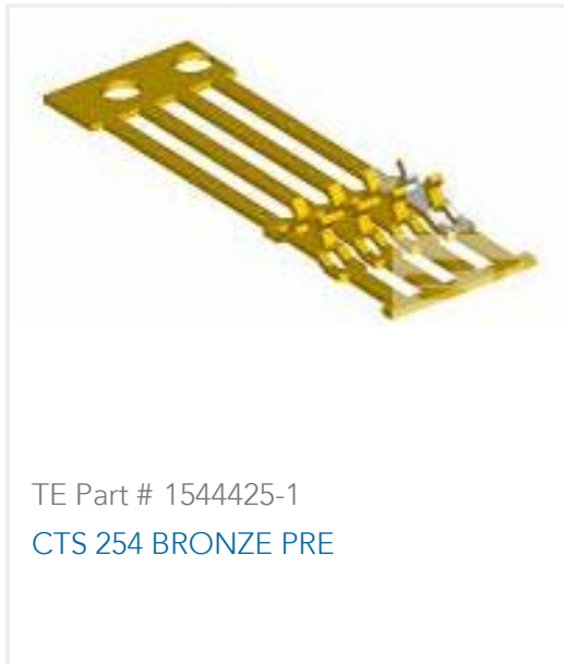
TE Part # 1544425-1 CTS 254 BRONZE PRE