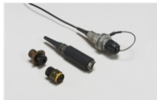
Expanded Beam Fiber Optics(14)