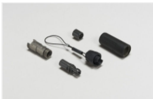
Expanded Beam Fiber Housings(5)