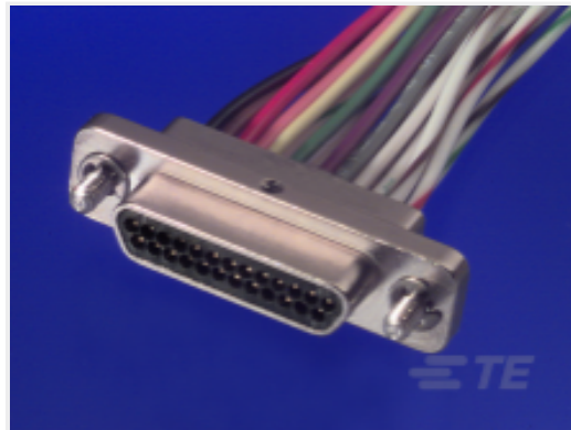
TE Part # 1-1532173-0 M83513/04-C14N, MCKS-N1-B-21S6G9-72.0