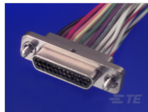
TE Part # 1532172-9 M83513/04-B13N, MCKS-N1-B-15S6G1-72.0