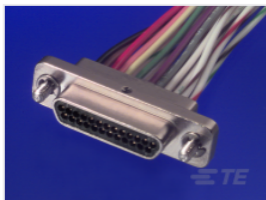
TE Part # 1532172-4 M83513/04-B04N, MCKS-N1-B-15S6G9-36.0