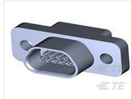
TE Part # 1532173-1 M83513/04-C01N, MCKS-N1-B-21S6G1-18.0