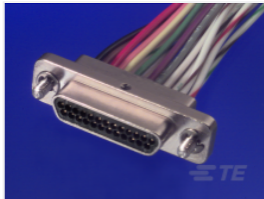
TE Part # 1532172-2 M83513/04-B02N, MCKS-N1-B-15S6G1-36.0