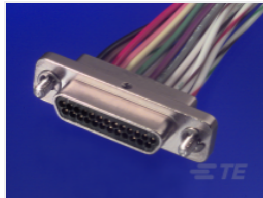
TE Part # 1532172-8 M83513/04-B12N, MCKS-N1-B-15S6Q9-36.0