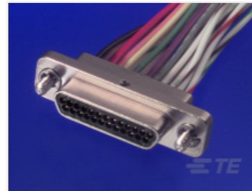
TE Part # 1532172-6 M83513/04-B10N, MCKS-N1-B-15S6Q1-36.0