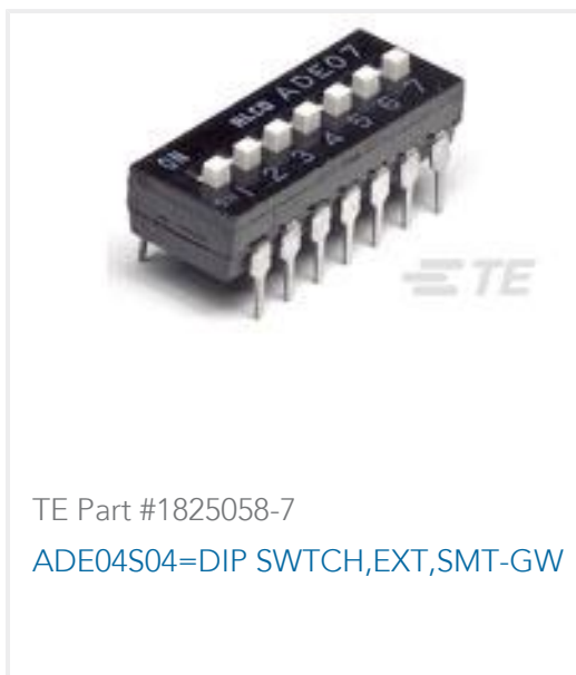
TE Part #1825058-7 ADE04S04=DIP SWTCH,EXT,SMT-GW