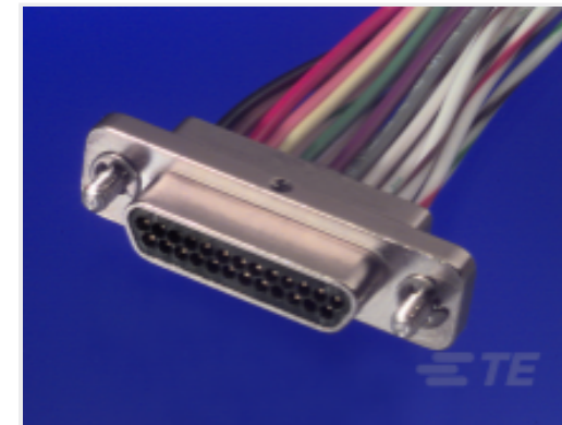
TE Part # 1-1532172-1 M83513/04-B15N, MCKS-N1-B-15S6Q1-72.0