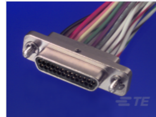
TE Part # 1532172-5 M83513/04-B09N, MCKS-N1-B-15S6Q1-18.0