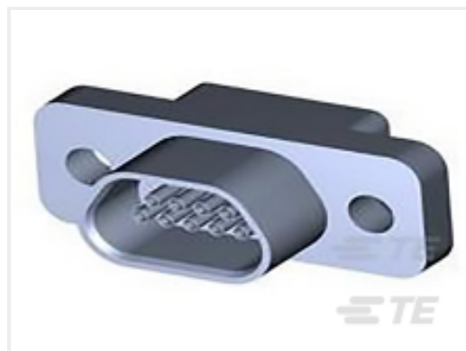
TE Part # 1-1532172-2 M83513/04-B16N, MCKS-N1-B-15S6Q9-72.0