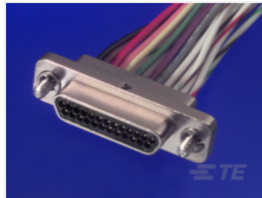
TE Part # 1532172-7 M83513/04-B11N, MCKS-N1-B-15S6Q9-18.0