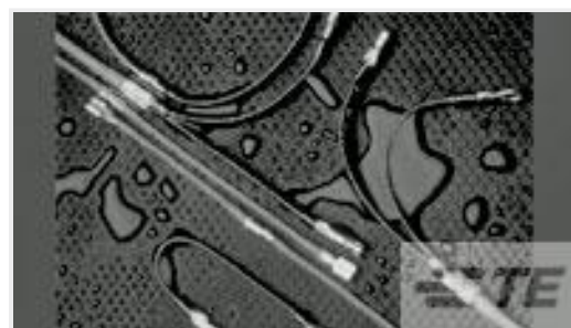
TE Part #CC2623-000 B-106-1601CS100