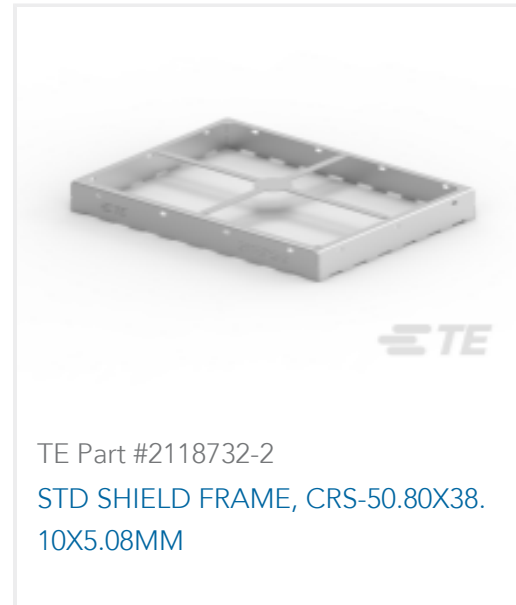
TE Part #2118732-2 STD SHIELD FRAME, CRS-50.80X38. 10X5.08MM