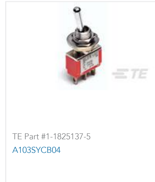
TE Part #1-1825137-5 A103SYCB04