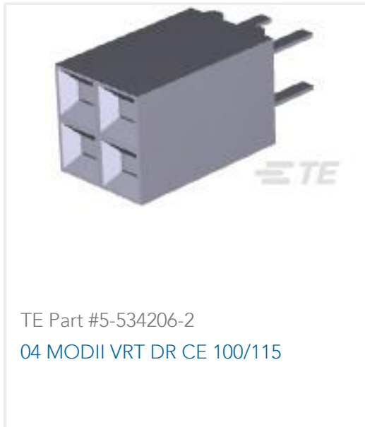
TE Part #5-534206-2 04 MODII VRT DR CE 100/115