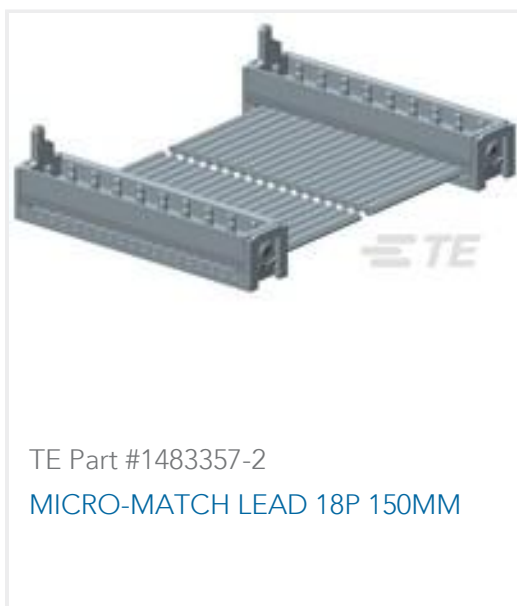
TE Part #1483357-2 MICRO-MATCH LEAD 18P 150MM