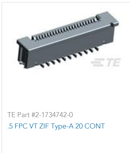
TE Part #2-1734742-0 5 FPC VT ZIF Type-A 20 CONT