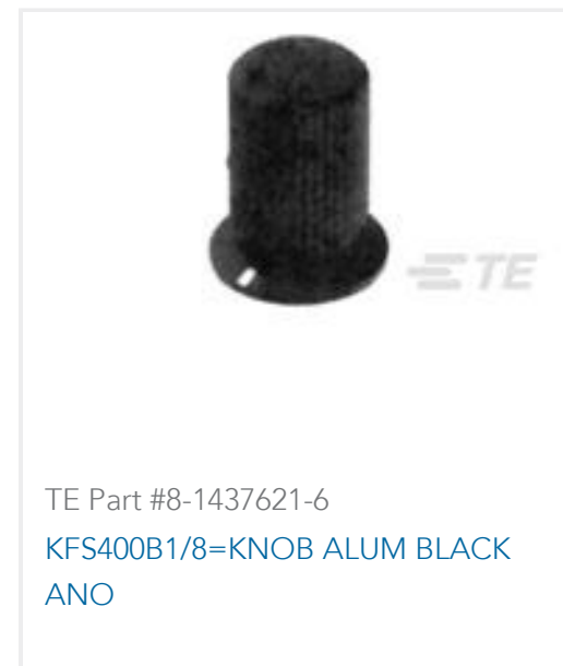
TE Part #8-1437621-6 KFS400B1/8=KNOB ALUM BLACK ANO