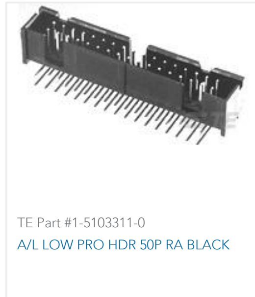
TE Part #1-5103311-0 A/L LOW PRO HDR 50P RA BLACK