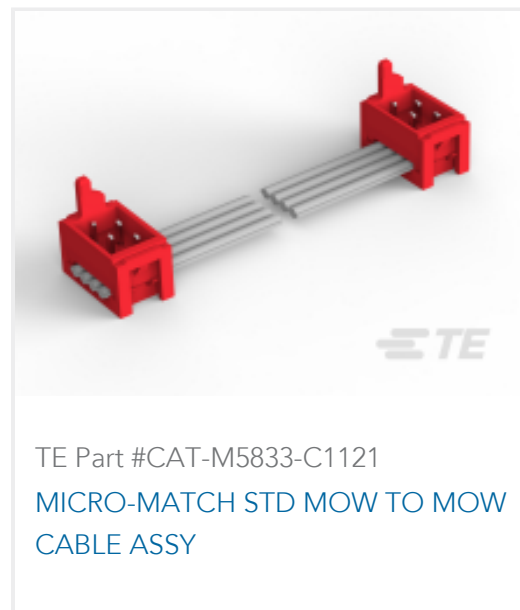
TE Part #CAT-M5833-C1121 MICRO-MATCH STD MOW TO MOW CABLE ASSY