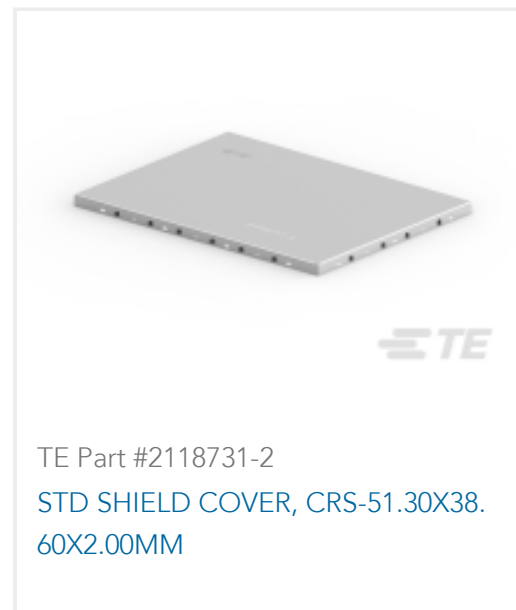
TE Part #2118731-2 STD SHIELD COVER, CRS-51.30X38. 60X2.00MM