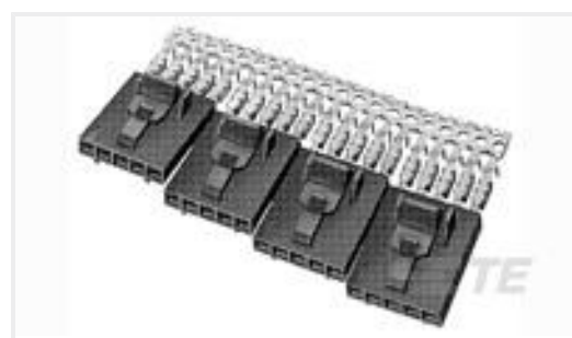
TE Part #5-103957-1 10X2 MTE RCPT SR LATCH .100CL