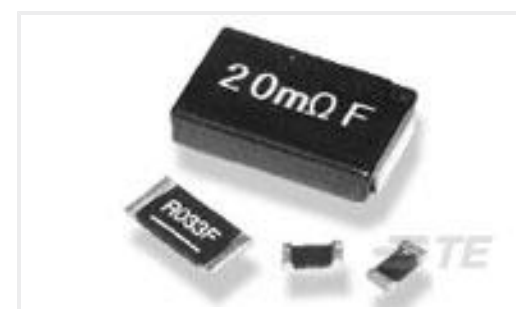
TE Part #3-1879378-1 TLR 2512 1.0W R0025 1% 150PPM 2K RL