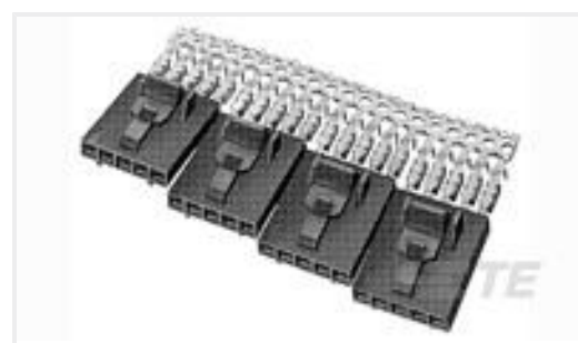
TE Part #5-103957-3 5X4 MTE RCPT SR LATCH .100CL