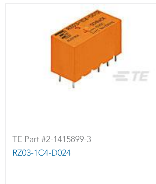
TE Part #2-1415899-3 RZ03-1C4-D024