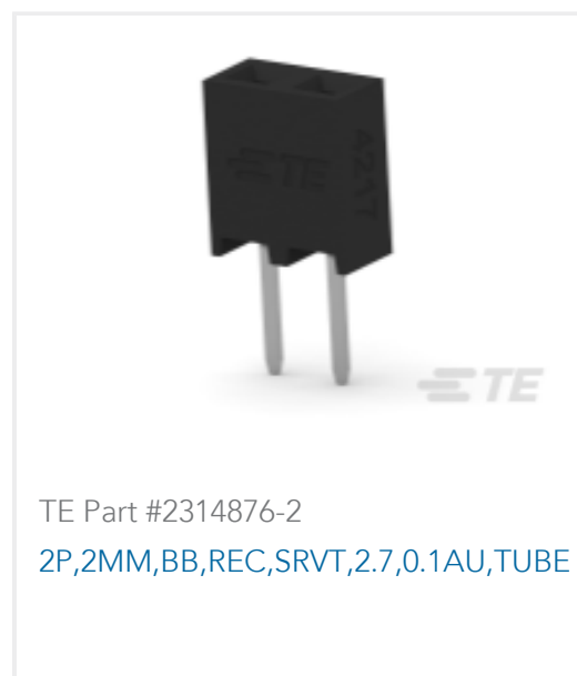
TE Part #2314876-2 2P,2MM,BB,REC,SRVT,2.7,0.1AU,TUBE