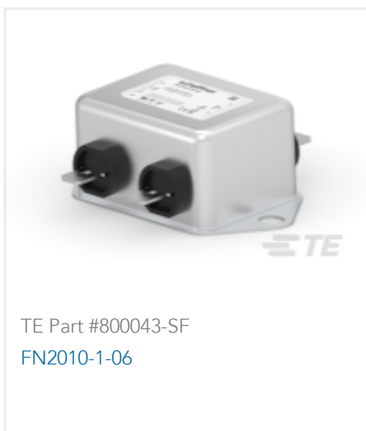
TE Part #800043-SF FN2010-1-06