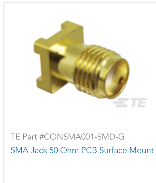
TE Part #CON SMA001-SMD-G SMA Jack 50 Ohm PCB Surface Mount