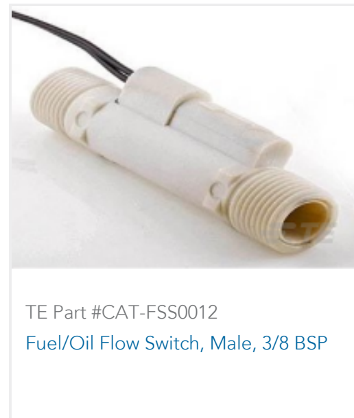
TE Part #CAT-FSS0012 Fuel/Oil Flow Switch, Male, 3/8 BSP