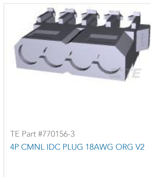
TE Part #770156-3 4P CMNL IDC PLUG 18AWG ORG V2