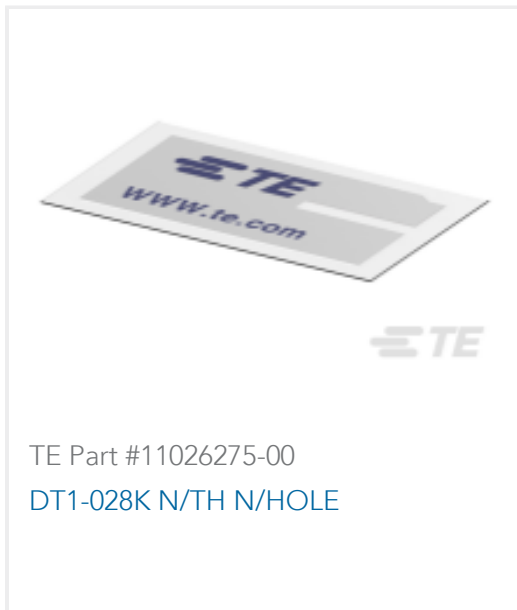
TE Part #11026275-00 DT1-028K N/TH N/HOLE