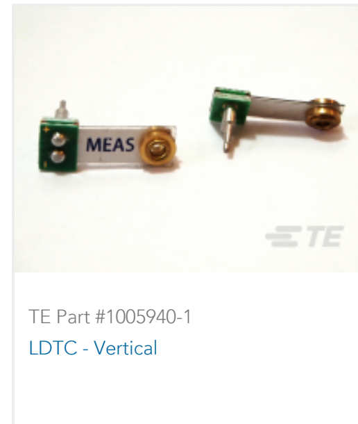
TE Part #1005940-1 LDTC - Vertical