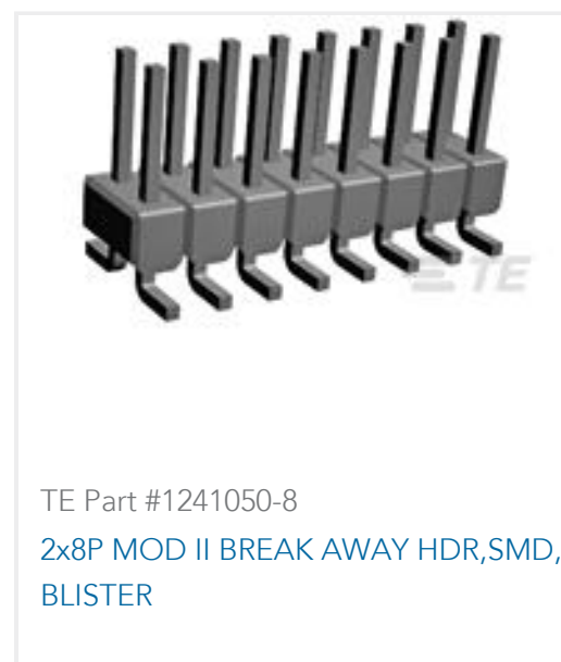
TE Part #1241050-8 2x8P MOD II BREAK AWAY HDR,SMD, BLISTER