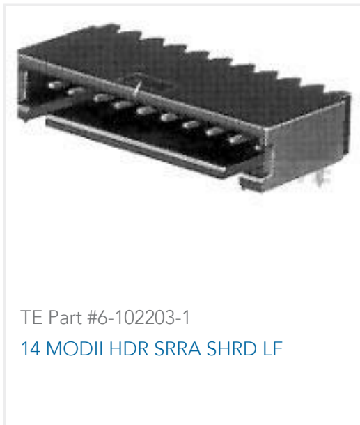
TE Part #6-102203-1 14 MODII HDR SRRA SHRD LF