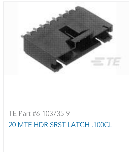
TE Part #6-103735-9 20 MTE HDR SRST LATCH .100CL