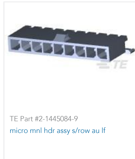
TE Part #2-1445084-9 micro mnl hdr assy s/row au lf