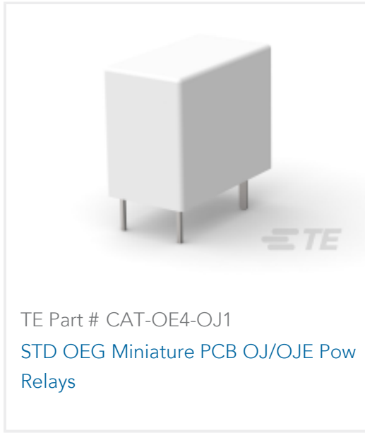
TE Part # CAT-OE4-OJ1 STD OEG Miniature PCB OJ/OJE Pow Relays