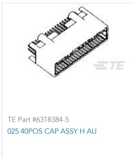
TE Part #6318384-5 025 40POS CAP ASSY H AU