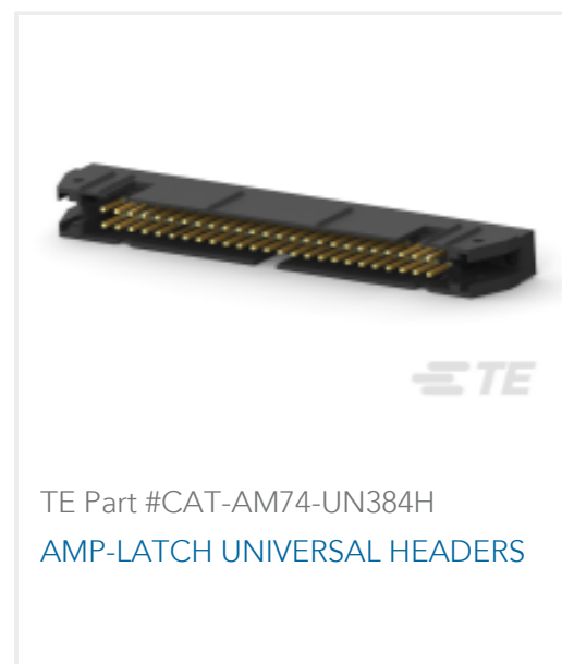
TE Part #CAT-AM74-UN384H AMP-LATCH UNIVERSAL HEADERS