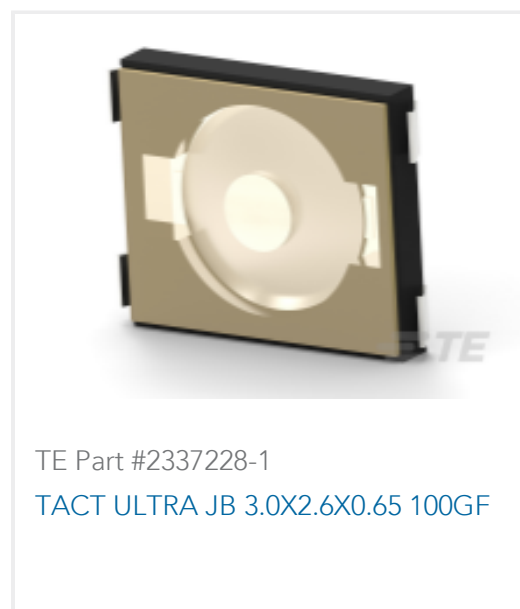
TE Part #2337228-1 TACT ULTRA JB 3.0X2.6X0.65 100GF