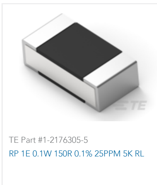
TE Part #1-2176305-5 RP 1E 0.1W 150R 0.1% 25PPM 5K RL