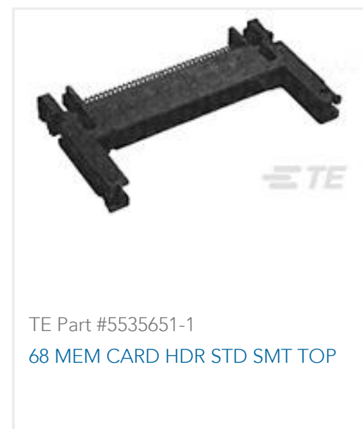
TE Part #5535651-1 68 MEM CARD HDR STD SMT TOP