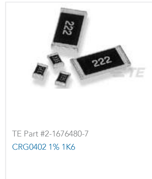
TE Part #2-1676480-7 CRG0402 1% 1K6