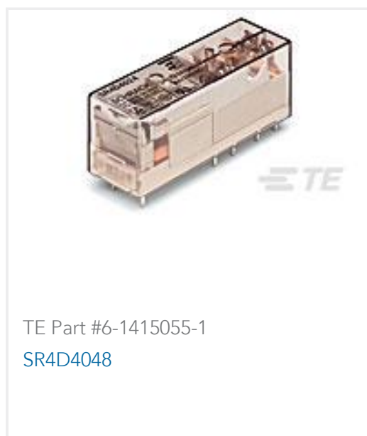
TE Part #6-1415055-1 SR4D4048