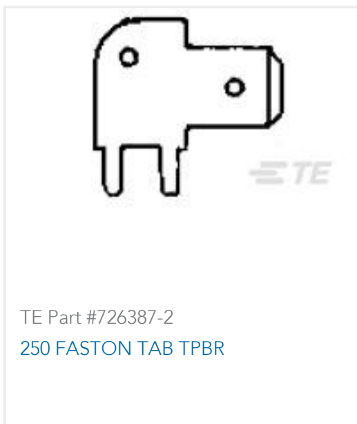
TE Part #726387-2 250 FASTON TAB TPBR