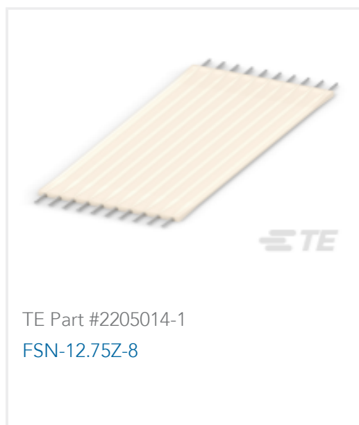
TE Part #2205014-1 FSN-12.75Z-8