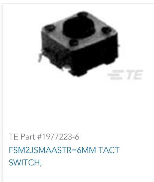
TE Part #1977223-6 FSM2JSMAASTR=6MM TACT SWITCH,