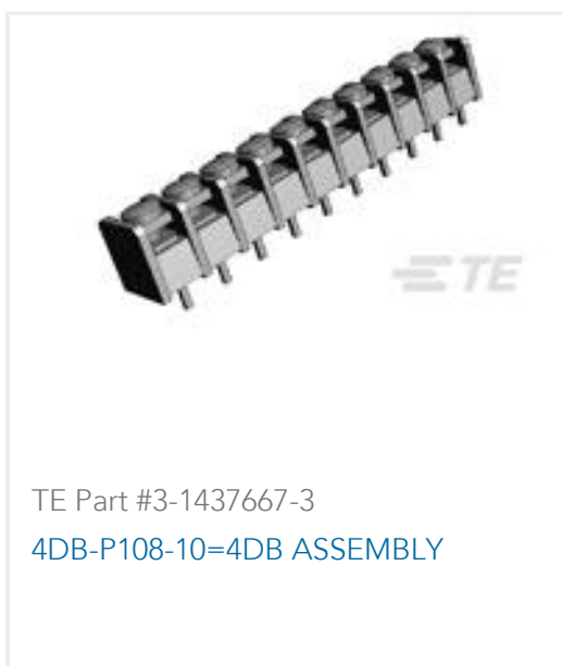
TE Part #3-1437667-3 4DB-P108-10=4DB ASSEMBLY