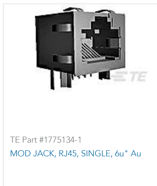
TE Part #1775134-1 MOD JACK, RJ45, SINGLE, 6u" Au