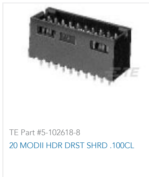
TE Part #5-102618-8 20 MODII HDR DRST SHRD .100CL