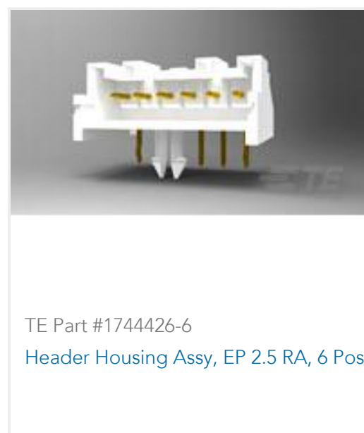
TE Part #1744426-6 Header Housing Assy, EP 2.5 RA, 6 Pos.