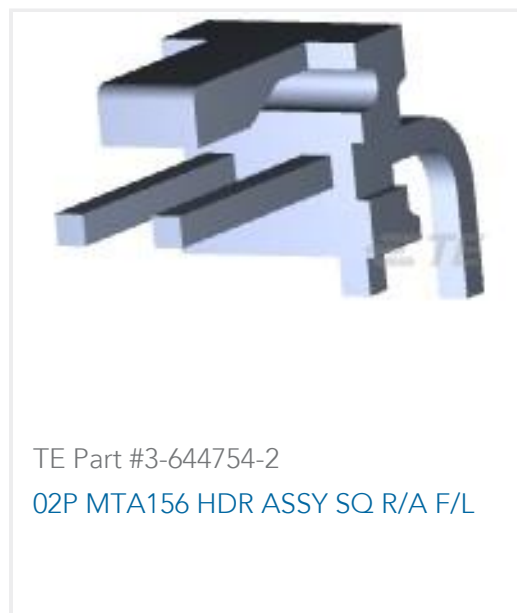
TE Part #3-644754-2 02P MTA156 HDR ASSY SQ R/A F/L