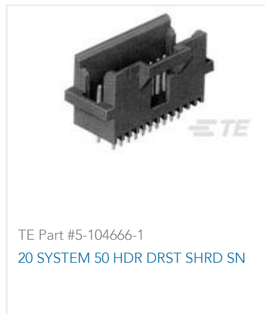
TE Part #5-104666-1 20 SYSTEM 50 HDR DRST SHRD SN