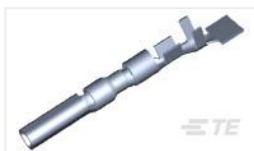
TE Part #794219-1 MINI UMN2 SOK 26-22 AWG SN