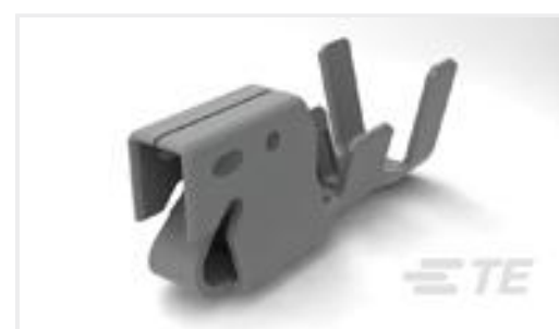
TE Part #1744144-1 EP-II CONTACT LANCELESS, 22-18