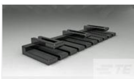
TE Part #1969443-5 EP 2.5 TPA Retainer, 5 Pos