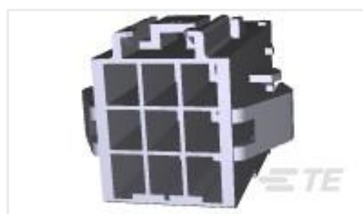
TE Part #177911-1 POWER DBL LOCK CAP HSG P/M 9P