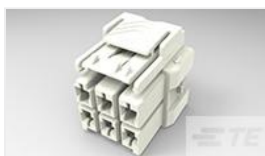
TE Part #1-1971776-3 PTL 2X3 PLUG HSG STD TEMP KEY A NAT