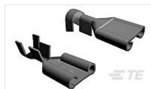
TE Part #60650-1 250 FASTON FLAG REC 18-14 AWG BR