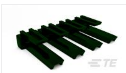
TE Part #1-2132782-2 12 pos. EP II breakaway retain