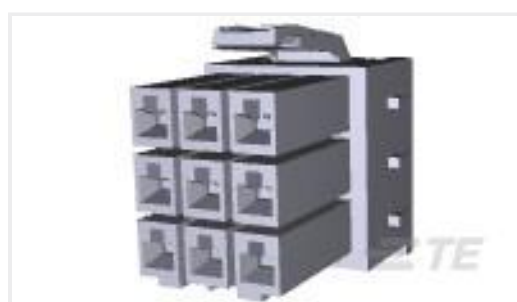
TE Part #177903-1 POWER DBL LOCK PLUG HSG 9P