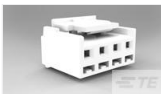
TE Part #2132781-4 04P EP-II HOUSING, NATURAL