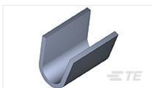
TE Part #61769-1 SPLICE 1200-2600 .020 BR