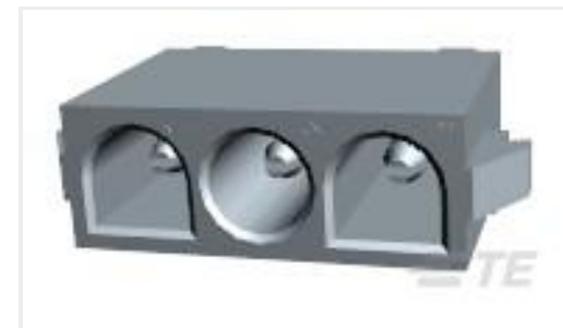
TE Part #350790-1 03P UMNL PIN HDR ASSY 94VO