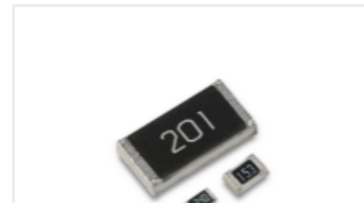
TE Part #2176328-7 CRGP 1206 33R 1%