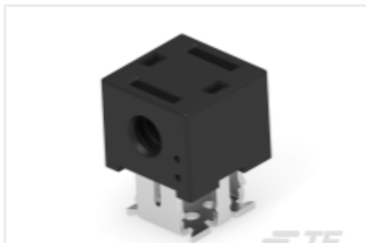
TE Part #474337-E IDCTERM 1 I2426 1,10 * 094 707 0007 J 2