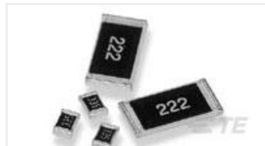
TE Part #1622963-1 CRG0603 1% 510R