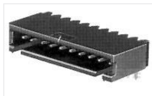
TE Part #102203-2 05 MODII HDR SRRA SHRD .100CL