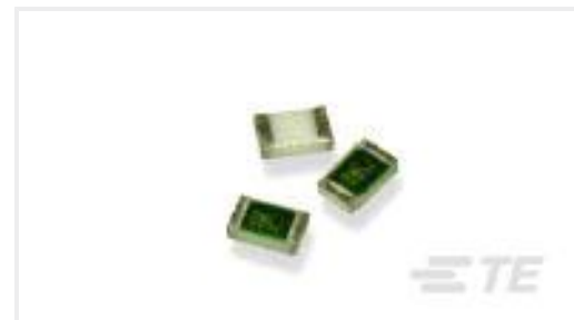
TE Part #9-1879335-1 CPF 0603 187R 1% 50PPM 1K RL