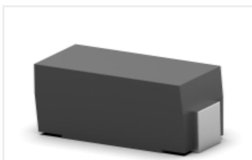
TE Part #4-2176459-3 SMW 7W 5R6 5% Taped