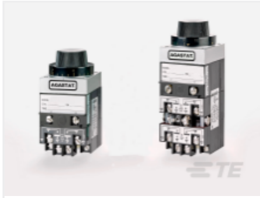
TE Part # 1423162-5 7022AC=RLY,STD,OFF,2P 120VAC,1