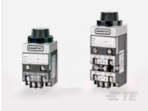
TE Part # 1423157-5 7012AC=RLY,STD,ON,2P,120VAC,15