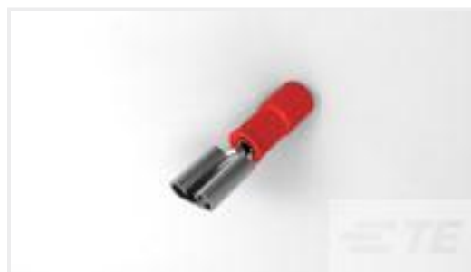
TE Part #640903-2 RECEPT,PIDG FASTON 22-18 250