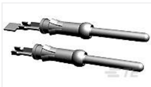
TE Part #66361-3 III+ PIN,18-14,15AU/FL,LP