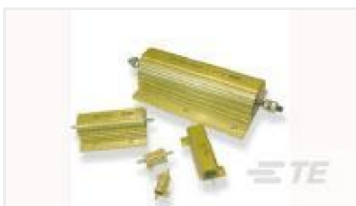
TE Part #5-1625999-4 HSC100 R50 5%