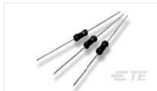
TE Part #1625881-4 1W STD M/OX 2% 27R