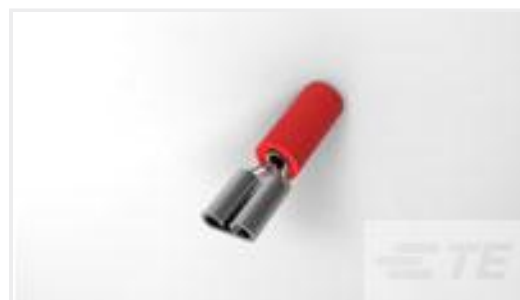
TE Part #640917-2 RECEPT,PIDG FASTON 22-18 187