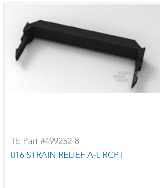
TE Part #499252-8 016 STRAIN RELIEF A-L RCPT