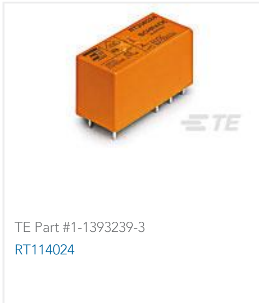
TE Part #1-1393239-3 RT114024