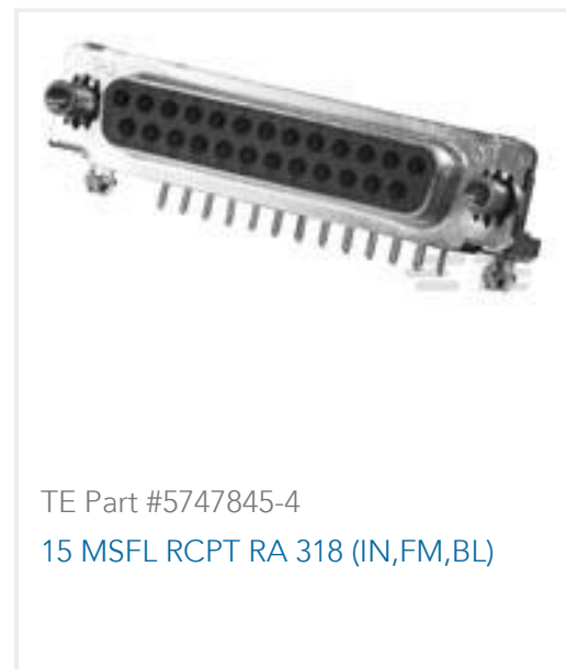
TE Part #5747845-4 15 MSFL RCPT RA 318 (IN,FM,BL)