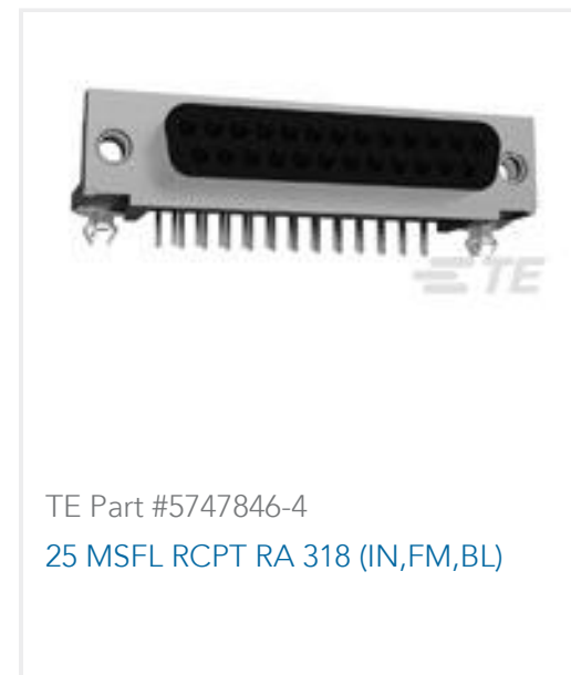
TE Part #5747846-4 25 MSFL RCPT RA 318 (IN,FM,BL)