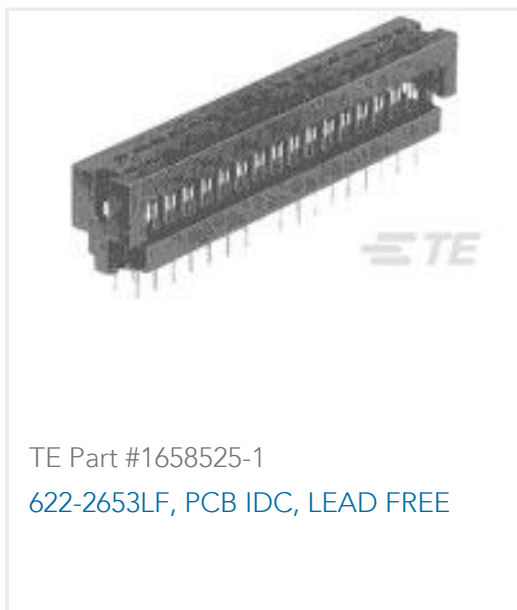
TE Part #1658525-1 622-2653LF, PCB IDC, LEAD FREE