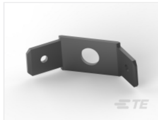
TE Part # 142241-2 250 FASTON,TAB,TPBR