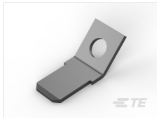
TE Part # 42822-4 250 FASTON TAB TPBR