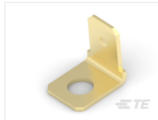
TE Part # 140734-1 250 FASTON,TAB,BR