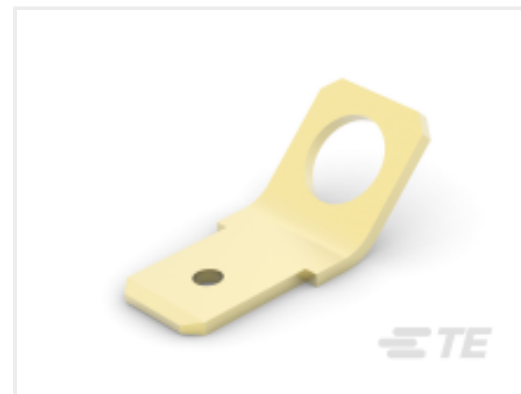
TE Part # 140665 250 FASTON,TAB,BR