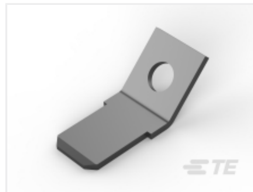
TE Part # 42822-2 250 FASTON TAB TPBR