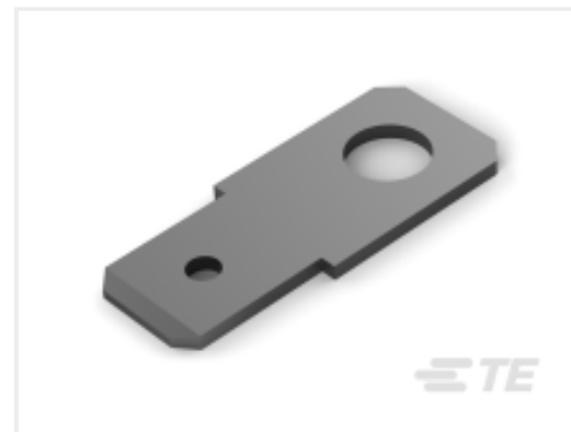
TE Part # 140734-2 250 FASTON,TAB,TPBR