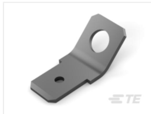
TE Part # 140814-2 250 FASTON,TAB,TPBR