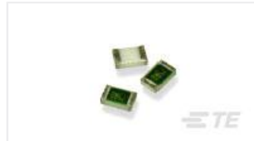
TE Part #9-1879225-1 CPF 0603 392K 0.1% 25PPM 1K RL