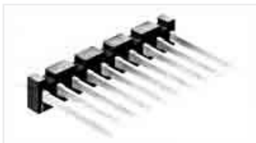
TE Part #1-85829-5 15 MODI HDR SRST .156CL