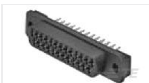
TE Part #5745455-2 09 RCPT ACT PIN/AP HIGH SCRLK