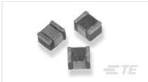
TE Part #2-1624112-4 3650 0402 27nH 5% 2K RL