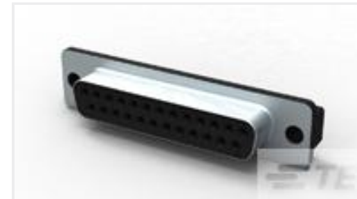
TE Part #5745967-2 25 RCPT SP/FMS STD