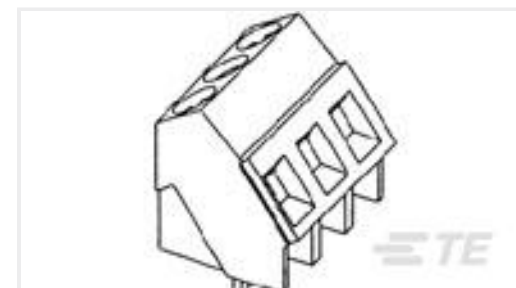
TE Part #796689-3 TERMI-BLOK PCB MOUNT 3P.