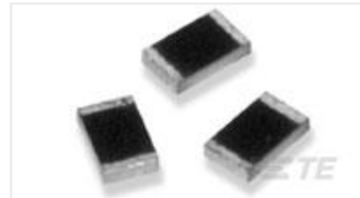
TE Part #1-1625868-9 RP 2A 0.25W 8K25 0.1% 25PPM 1K RL