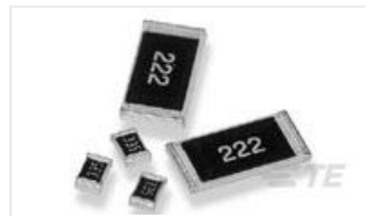
TE Part #1623097-1 CRG0805 1% 10K