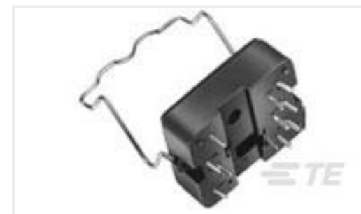
TE Part #1-1393824-0 V23154Z1028