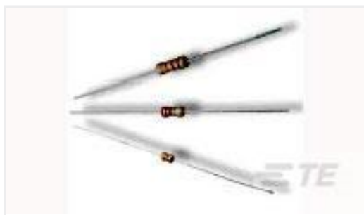
TE Part #4-1623925-9 CFR100 5% 68R