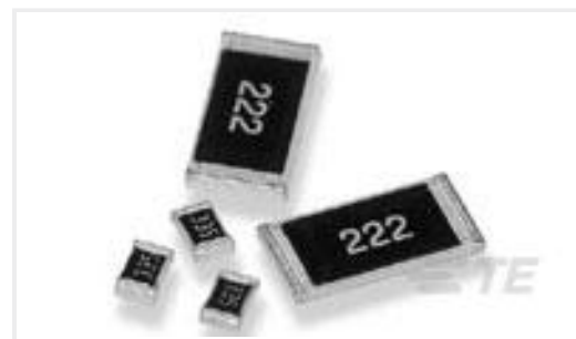
TE Part #6-1622826-4 CRG0402 ZEROHM