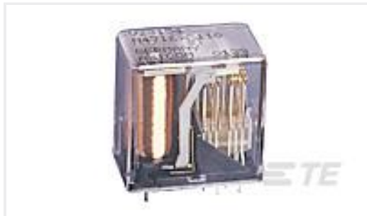
TE Part #3-1393813-6 V23054E 20B133