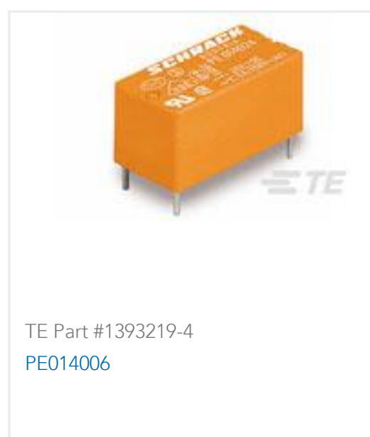
TE Part #1393219-4 PE014006