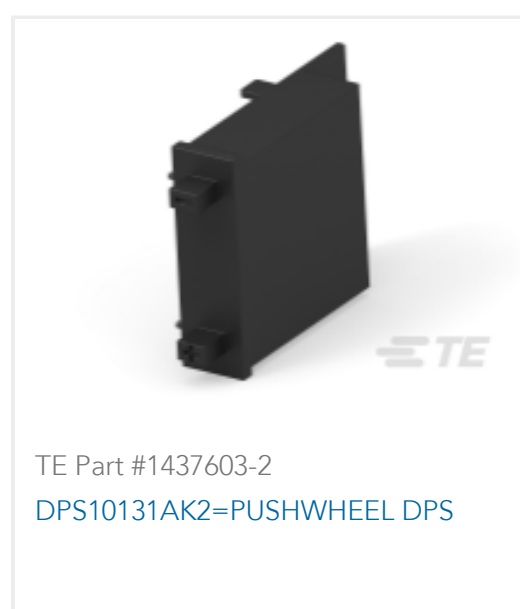
TE Part #1437603-2 DPS10131AK2=PUSHWHEEL DPS