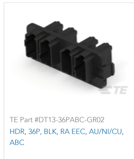
TE Part #DT13-36PABC-GR02 HDR, 36P, BLK, RA EEC, AU/NI/CU, ABC