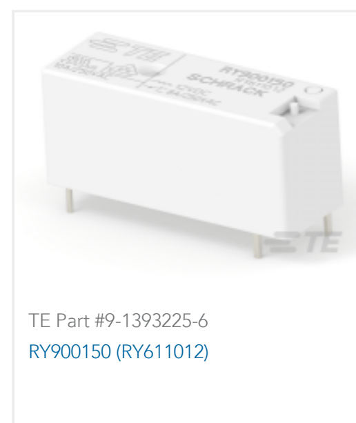
TE Part #9-1393225-6 RY900150 (RY611012)