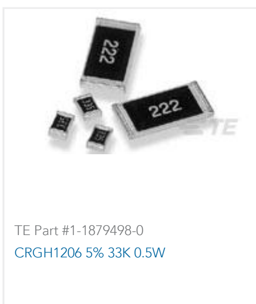
TE Part #1-1879498-0 CRGH1206 5% 33K 0.5W