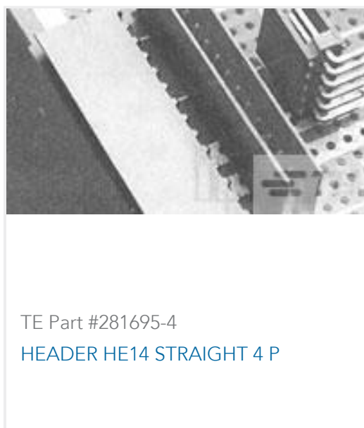
TE Part #281695-4 HEADER HE14 STRAIGHT 4 P