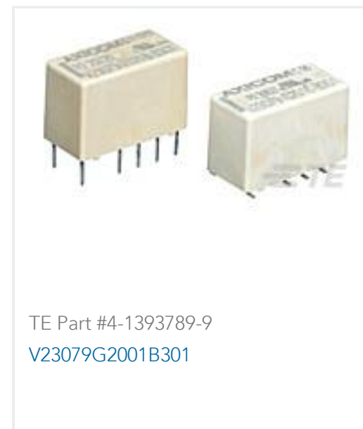
TE Part #4-1393789-9 V23079G2001B301