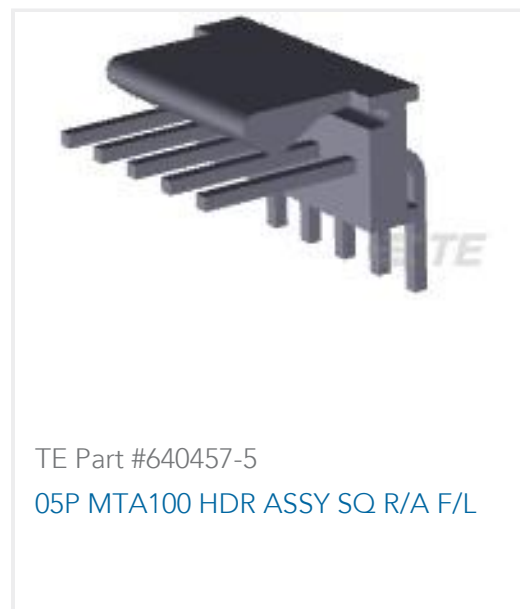
TE Part #640457-5 05P MTA100 HDR ASSY SQ R/A F/L