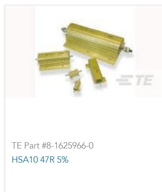
TE Part #8-1625966-0 HSA10 47R 5%