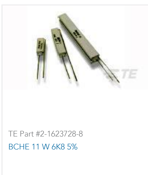
TE Part #2-1623728-8 BCHE 11 W 6K8 5%