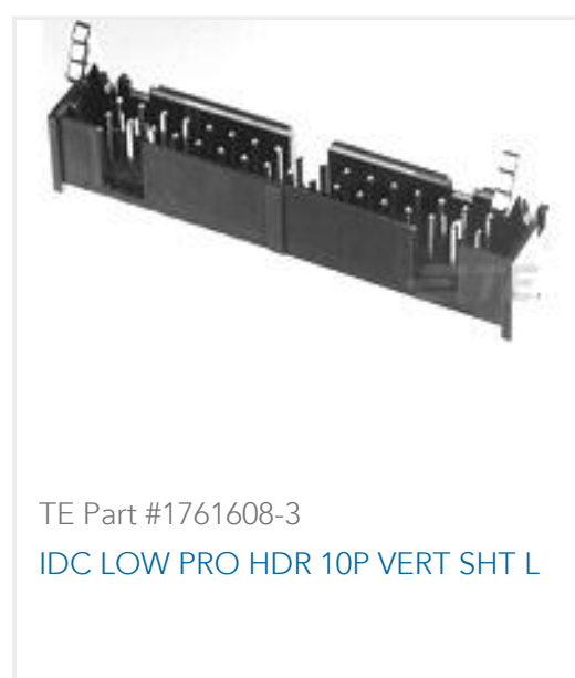
TE Part #1761608-3 IDC LOW PRO HDR 10P VERT SHT L