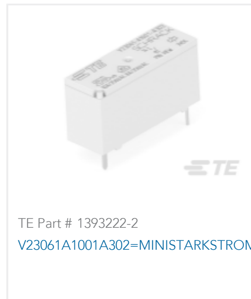
TE Part # 1393222-2 V23061A1001A302=MINISTARKSTROM