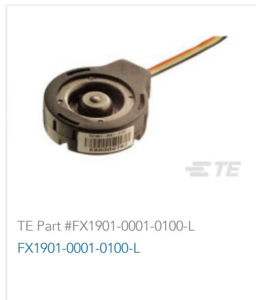
TE Part #FX1901-0001-0100-L FX1901-0001-0100-L