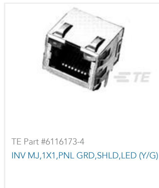
TE Part #6116173-4 INV MJ,1X1,PNL GRD,SHLD,LED (Y/G)