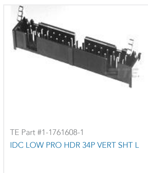
TE Part #1-1761608-1 IDC LOW PRO HDR 34P VERT SHT L