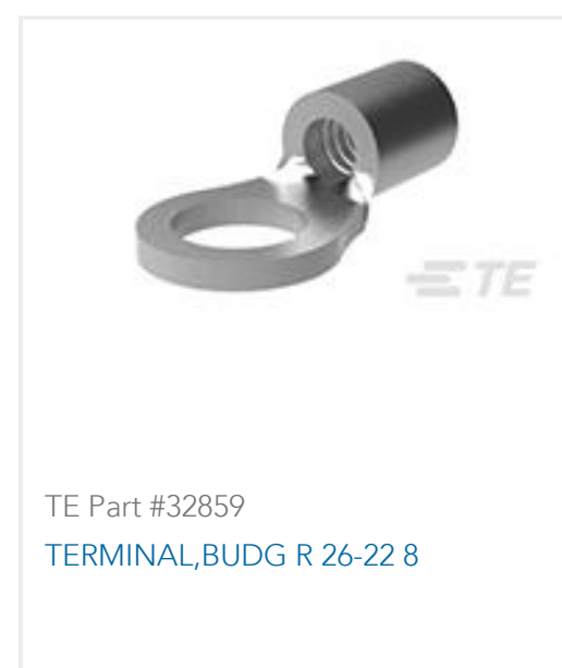
TE Part #32859 TERMINAL,BUDG R 26-22 8