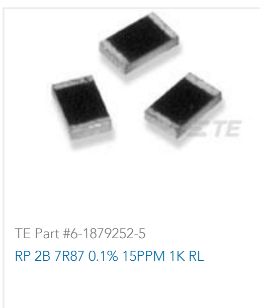
TE Part #6-1879252-5 RP 2B 7R87 0.1% 15PPM 1K RL