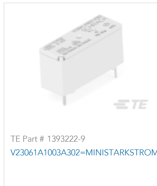
TE Part # 1393222-9 V23061A1003A302=MINISTARKSTROM