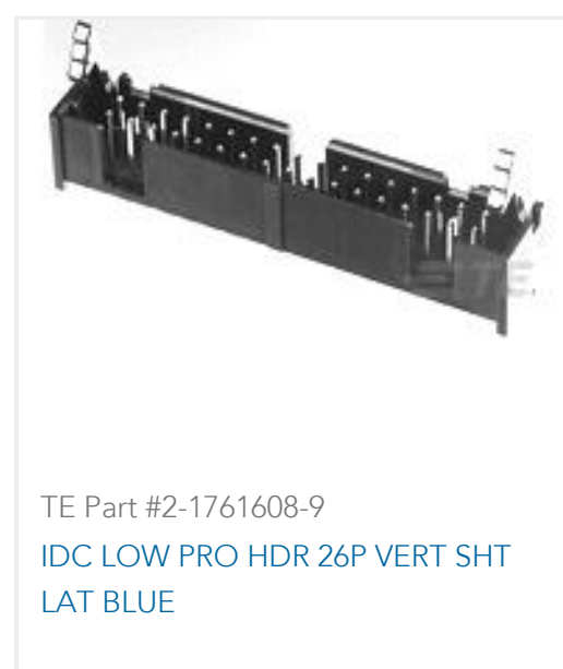
TE Part #2-1761608-9 IDC LOW PRO HDR 26P VERT SHT LAT BLUE