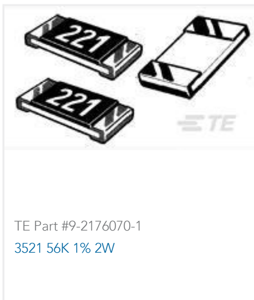
TE Part #9-2176070-1 3521 56K 1% 2W