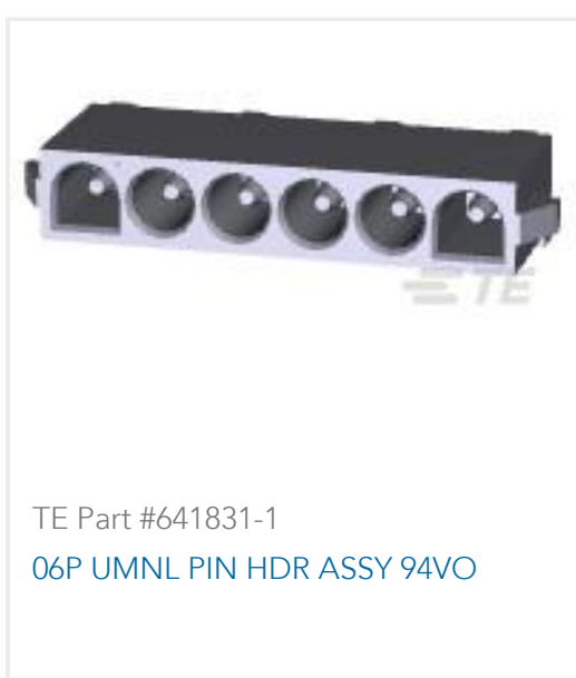
TE Part #641831-1 06P UMNL PIN HDR ASSY 94VO