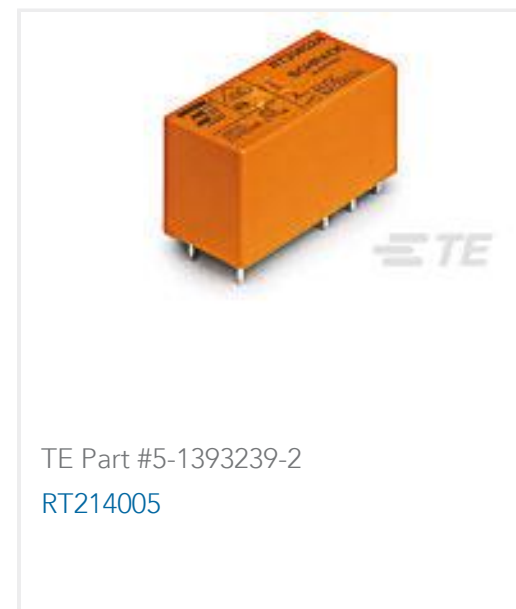
TE Part #5-1393239-2 RT214005