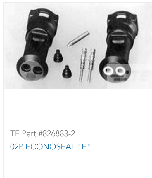
TE Part #826883-2 02P ECONOSEAL "E"