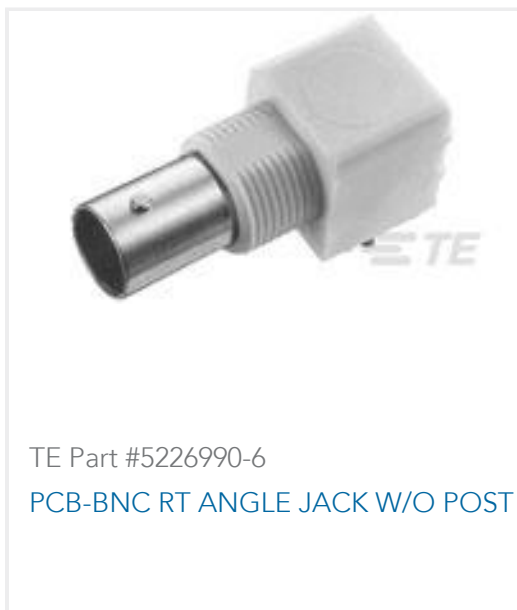
TE Part #5226990-6 PCB-BNC RT ANGLE JACK W/O POST