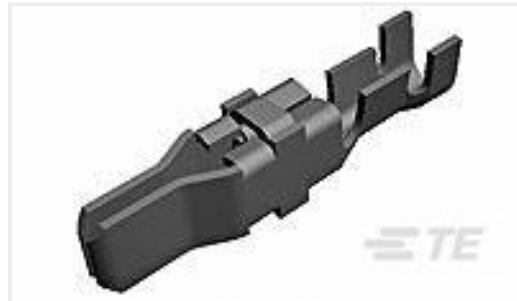
TE Part #66253-8 MALE CONTACT ASSY. (STRIP)