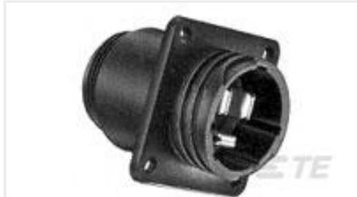
TE Part #206036-2 CPC RECEPTACLE SIZE 17-3