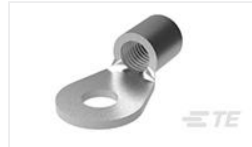
TE Part #321598 TERMINAL,SOLIS R 6 1/4