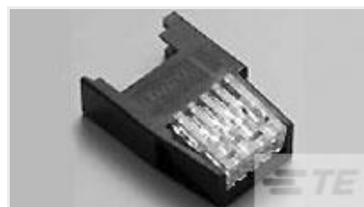
TE Part #2-1746741-8 RITS CONN. SOCKET ASSY 8P BLUE