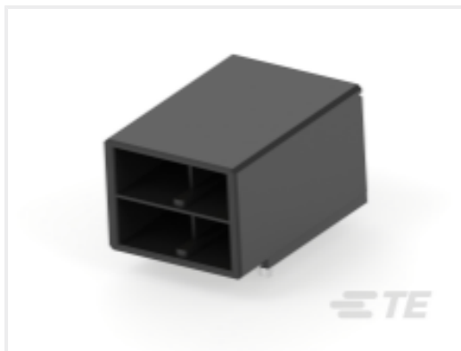
TE Part #CAT-D9934-A83B DYNAMIC 5000 HDR ASSY