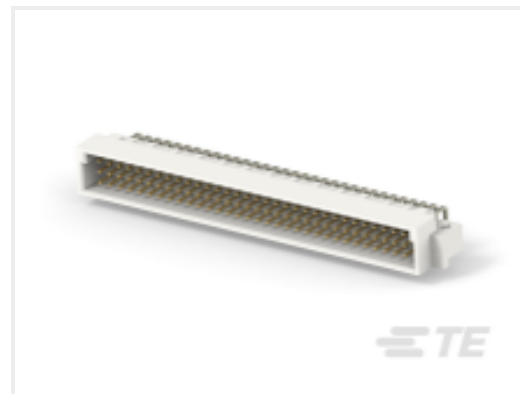
TE Part #6-2271013-0 CELLO,PIN,96P,TH,RA,FG,DIP4.0,-