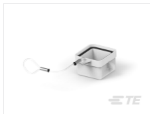
TE Part #T1009033100-000 H3A-KDBP