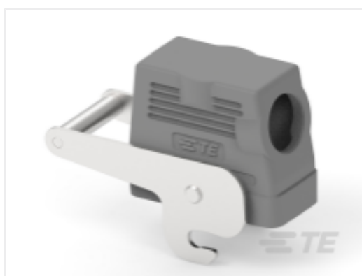
TE Part #T1390160132-001 H16B-TSH-RC-M32