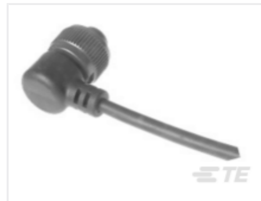
TE Part #318A-120 CABLE 318A