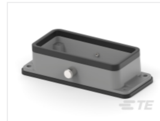
TE Part #T1550160000-001 H16B-AG-RC