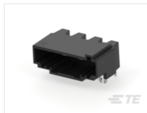
TE Part #CAT-D9934-A75I Header Assembly: Wire-to-Board Connector, Spring Clamp, 7.5 mm pitch, 14.5A