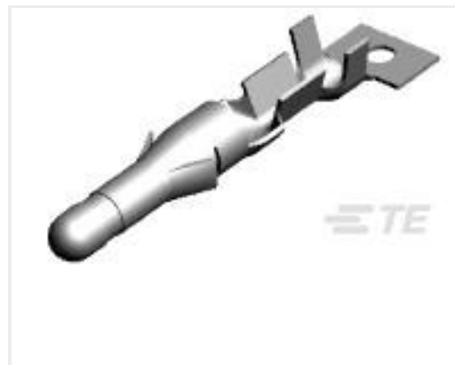
TE Part #770147-5 .093 CP&S PIN AUBR LP 24-18