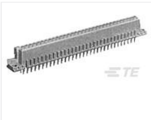
TE Part #5650858-5 ASSEMBLY, RECEPTACLE, EUROCARD, T