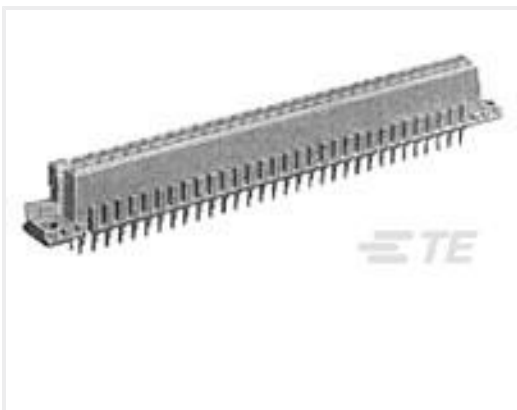
TE Part #5650861-5 ASSEMBLY, RECEPTACLE, EUROCARD, T