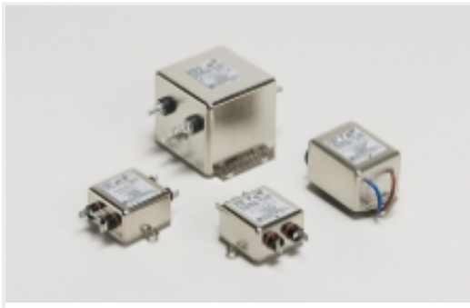
Single Phase Filters(32)