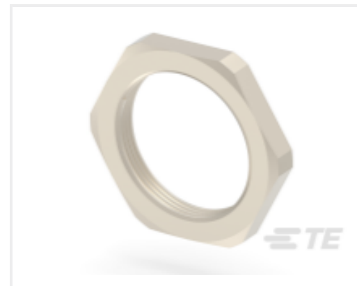
TE Part #1SNG608014R0000 EM-LN-NPT114-MET-A