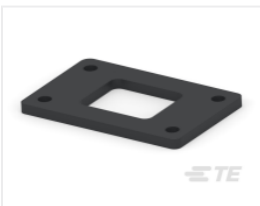
TE Part #DT8P-L012-GKT GASKET, 8P, BLK, DT/DTM