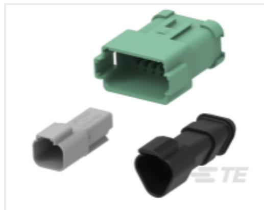
TE Part #CAT-J41-DDRC DEUTSCH DT Receptacle Connectors