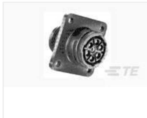
TE Part #211398-2 CPC RECPT. SIZE 13-7