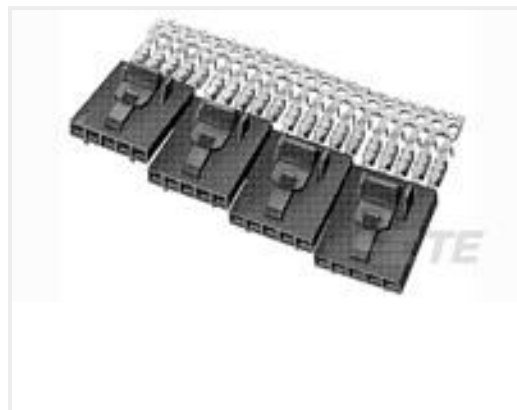
TE Part #5-103956-4 4X5 MTE RCPT SR LATCH .100CL