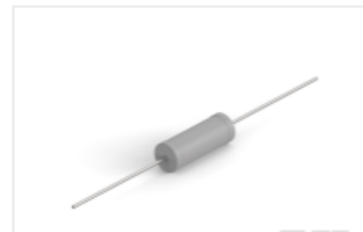
TE Part #2176413-1 5W XSM M/OX 5% 68K