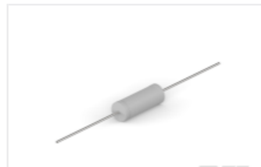
TE Part #9-2176412-6 5W XSM M/OX 5% 47K