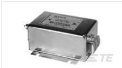
TE Part #6609070-1 6FCD10 J0=F7737