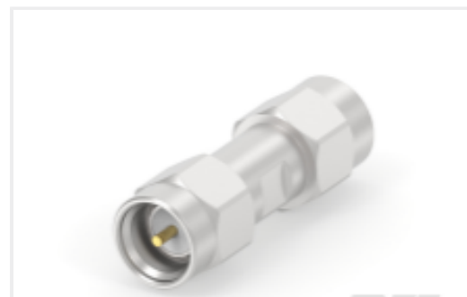
TE Part #2081890-1 EP-SMA,ADAPTER,STRAIGHT,27GHZ, M TO M