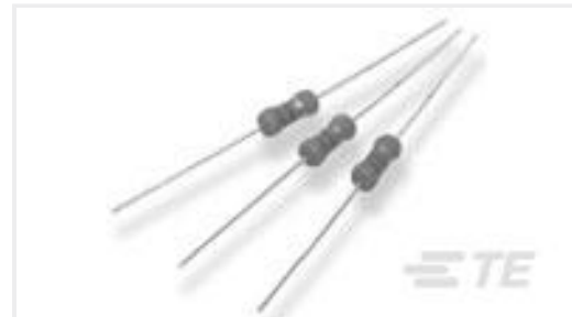
TE Part #1625879-3 FRN50 5% 1K0 (S)