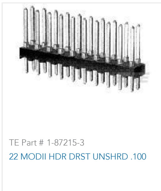
TE Part # 1-87215-3 22 MODII HDR DRST UNSHRD .100