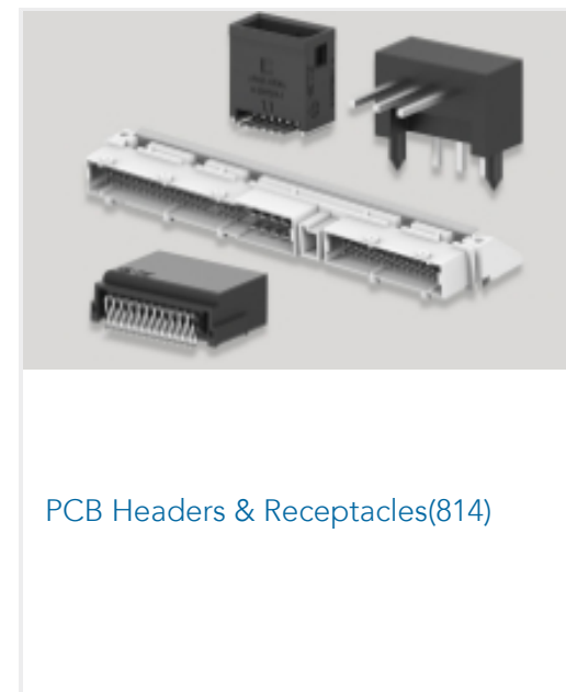
PCB Headers & Receptacles(814)