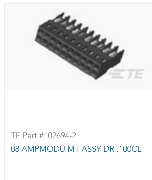
TE Part #102694-2 08 AMPMODU MT ASSY DR .100CL