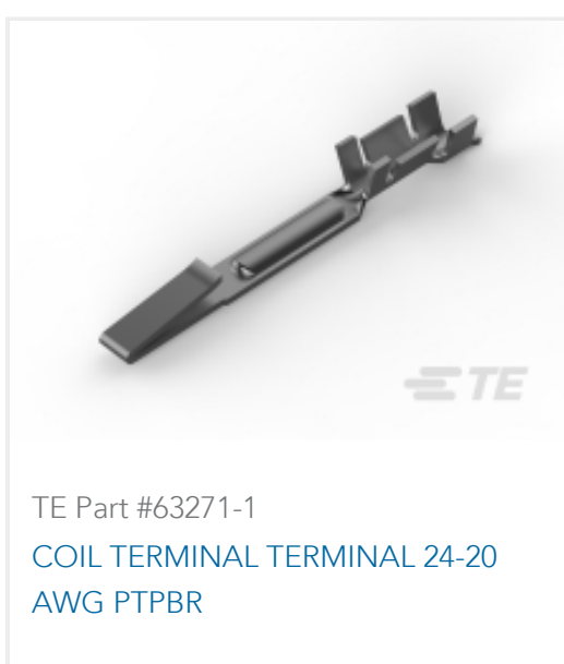
TE Part #63271-1 COIL TERMINAL TERMINAL 24-20 AWG PTPBR