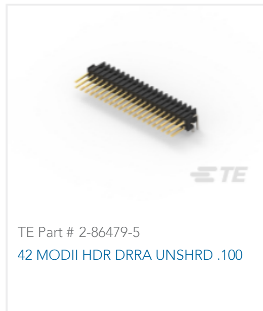
TE Part # 2-86479-5 42 MODII HDR DRRA UNSHRD .100