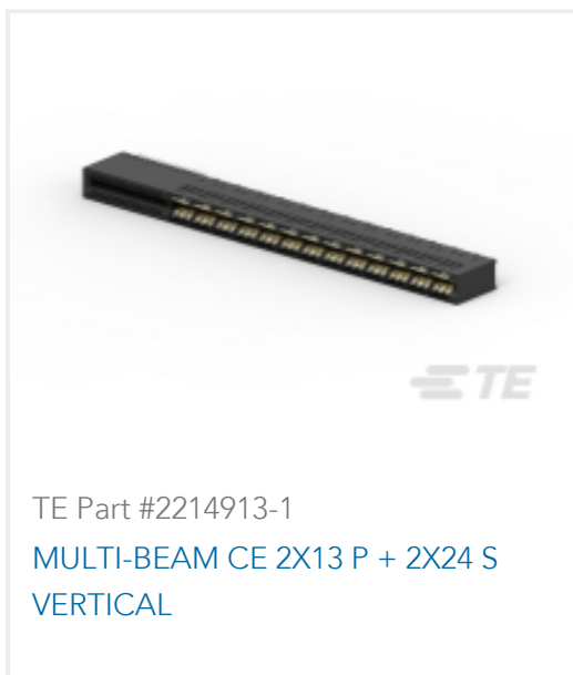
TE Part #2214913-1 MULTI-BEAM CE 2X13 P + 2X24 S VERTICAL