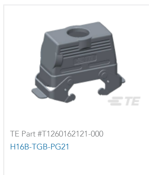
TE Part #T1260162121-000 H16B-TGB-PG21