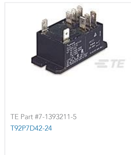
TE Part #7-1393211-5 T92P7D42-24