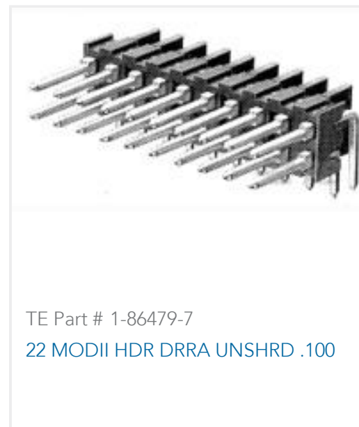
TE Part # 1-86479-7 22 MODII HDR DRRA UNSHRD .100