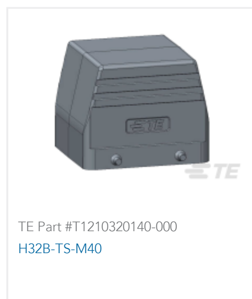
TE Part #T1210320140-000 H32B-TS-M40