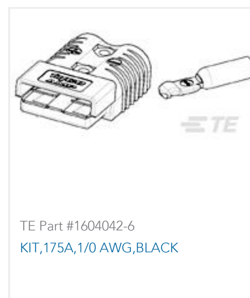
TE Part #1604042-6 KIT,175A,1/0 AWG,BLACK