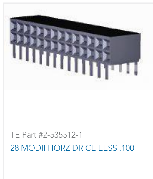
TE Part #2-535512-1 28 MODII HORZ DR CE EESS .100