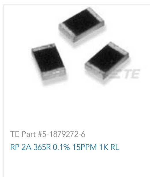
TE Part #5-1879272-6 RP 2A 365R 0.1% 15PPM 1K RL