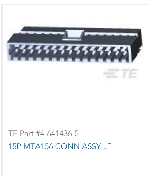
TE Part #4-641436-5 15P MTA156 CONN ASSY LF