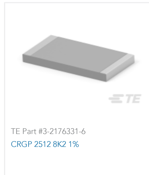
TE Part #3-2176331-6 CRGP 2512 8K2 1%