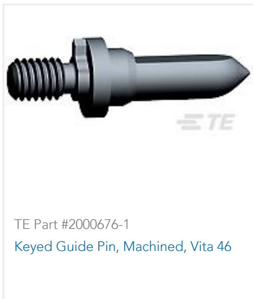
TE Part #2000676-1 Keyed Guide Pin, Machined, Vita 46