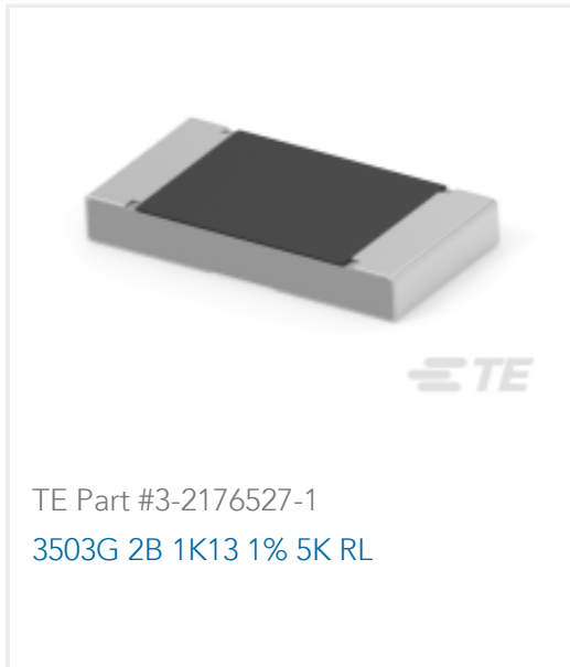
TE Part #3-2176527-1 3503G 2B 1K13 1% 5K RL