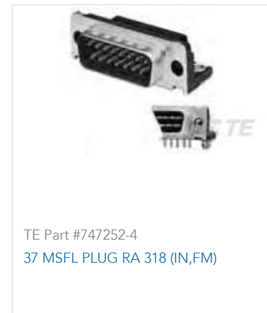
TE Part #747252-4 37 MSFL PLUG RA 318 (IN,FM)