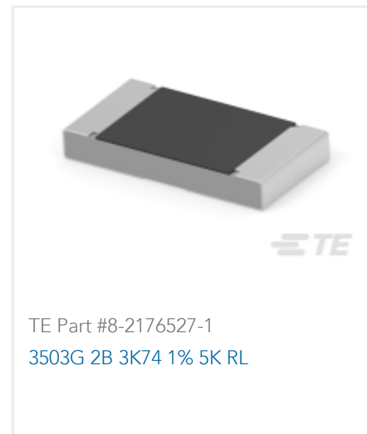
TE Part #8-2176527-1 3503G 2B 3K74 1% 5K RL