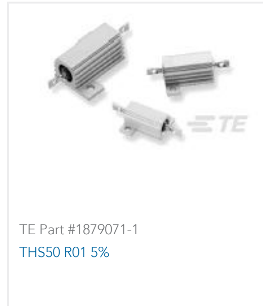
TE Part #1879071-1 THS50 R01 5%