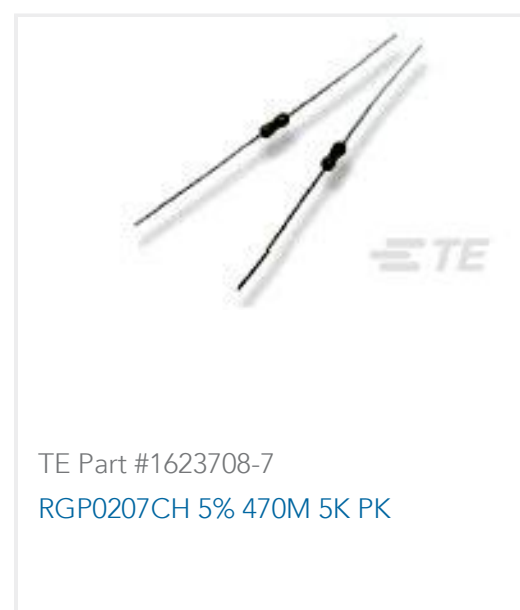
TE Part #1623708-7 RGP0207CH 5% 470M 5K PK