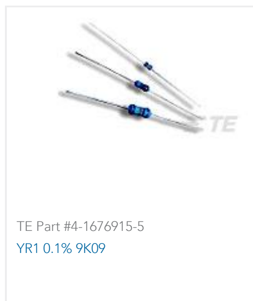
TE Part #4-1676915-5 YR1 0.1% 9K09