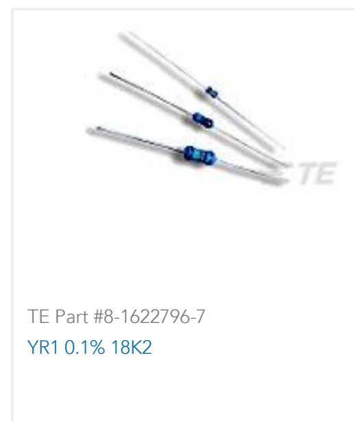
TE Part #8-1622796-7 YR1 0.1% 18K2