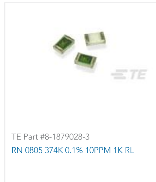
TE Part #8-1879028-3 RN 0805 374K 0.1% 10PPM 1K RL