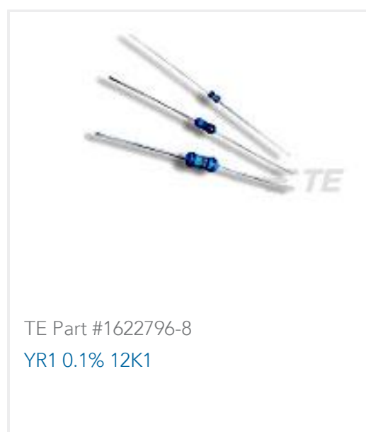
TE Part #1622796-8 YR1 0.1% 12K1