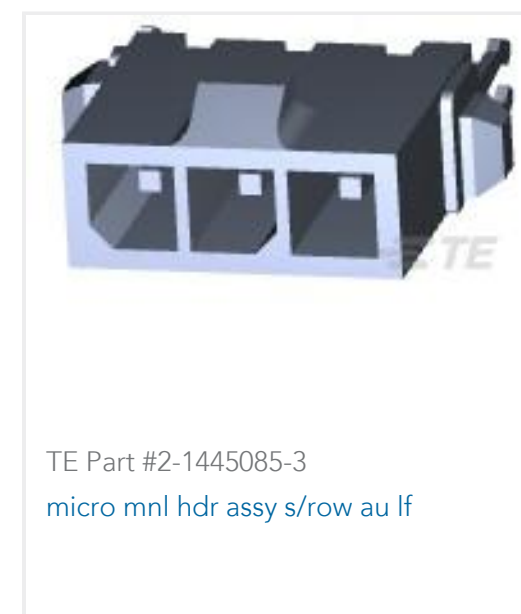
TE Part #2-1445085-3 micro mnl hdr assy s/row au lf