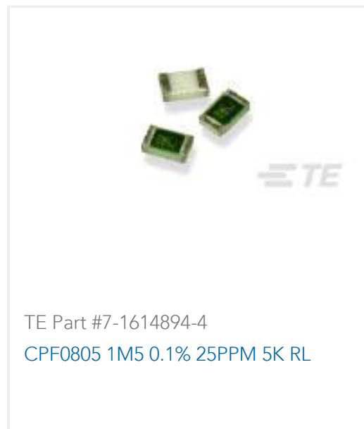
TE Part #7-1614894-4 CPF0805 1M5 0.1% 25PPM 5K RL