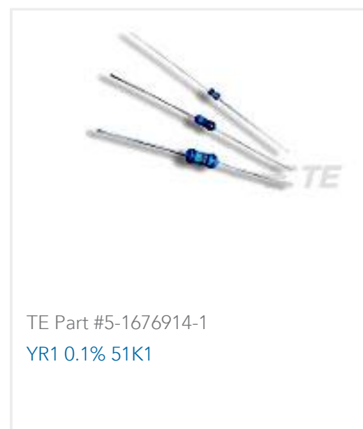
TE Part #5-1676914-1 YR1 0.1% 51K1