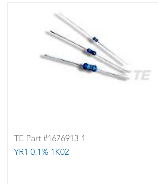
TE Part #1676913-1 YR1 0.1% 1K02