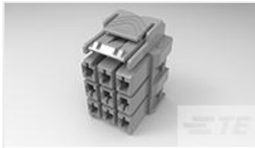
TE Part #5-1971876-3 PTL 3X3 PLUG HSG HIGH TEMP KEY A LGR