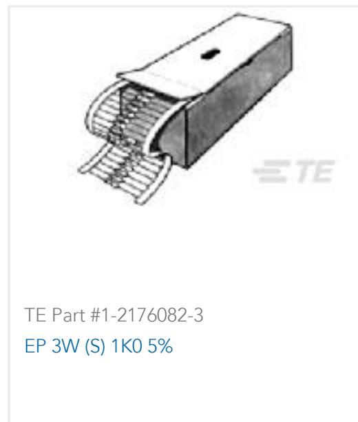
TE Part #1-2176082-3 EP 3W (S) 1K0 5%