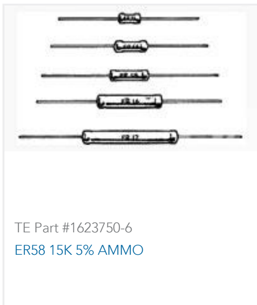
TE Part #1623750-6 ER58 15K 5% AMMO