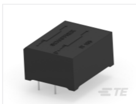
TE Part #800056-SF IT155