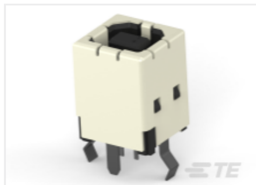
TE Part #5788336-1 STD USB TYPE B, VERTICAL, T/H